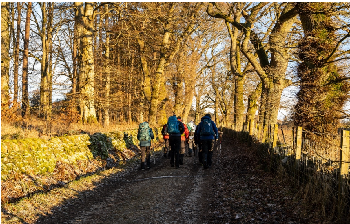
A brisk walk up the estate road from Tulliemet