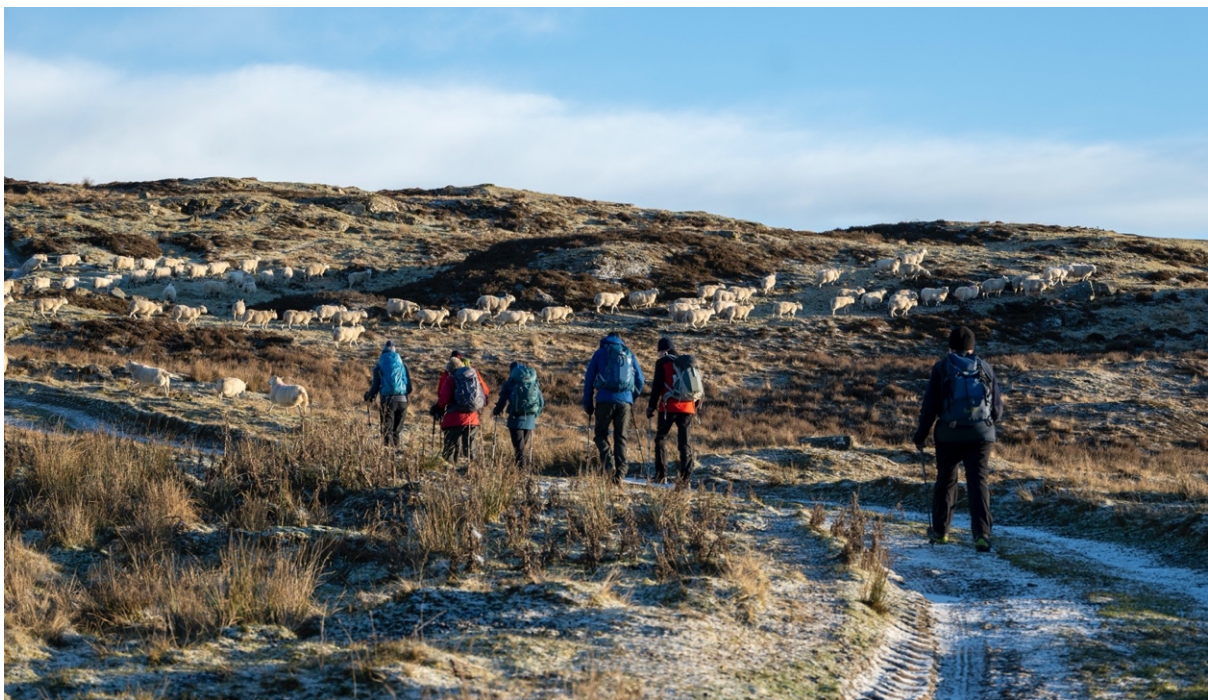
On to the moorland where we are confronted by a pack of angry fierce sheep.