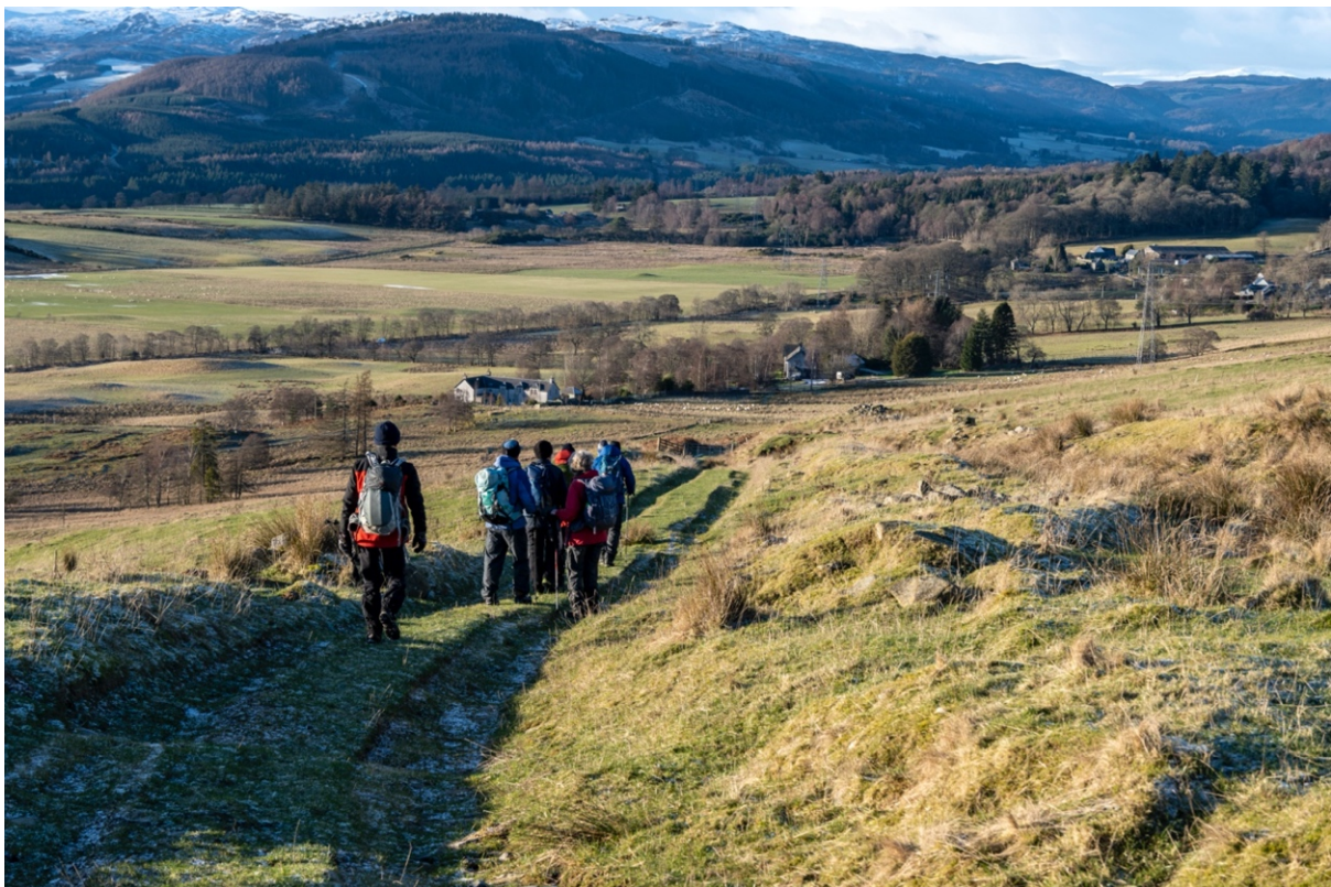
Down the track to Tulliemet