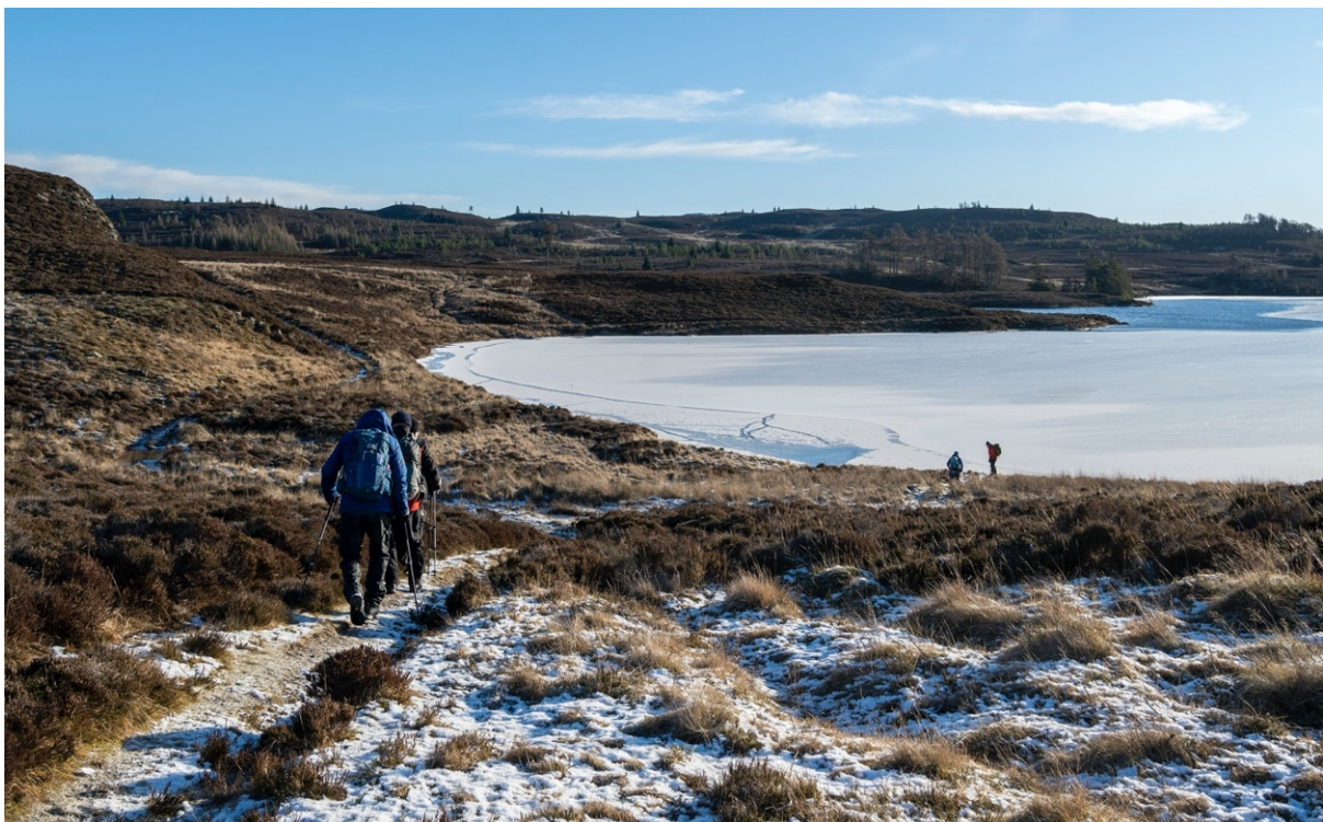
Arriving at Lochan Oisinnich Mor and time for coffee