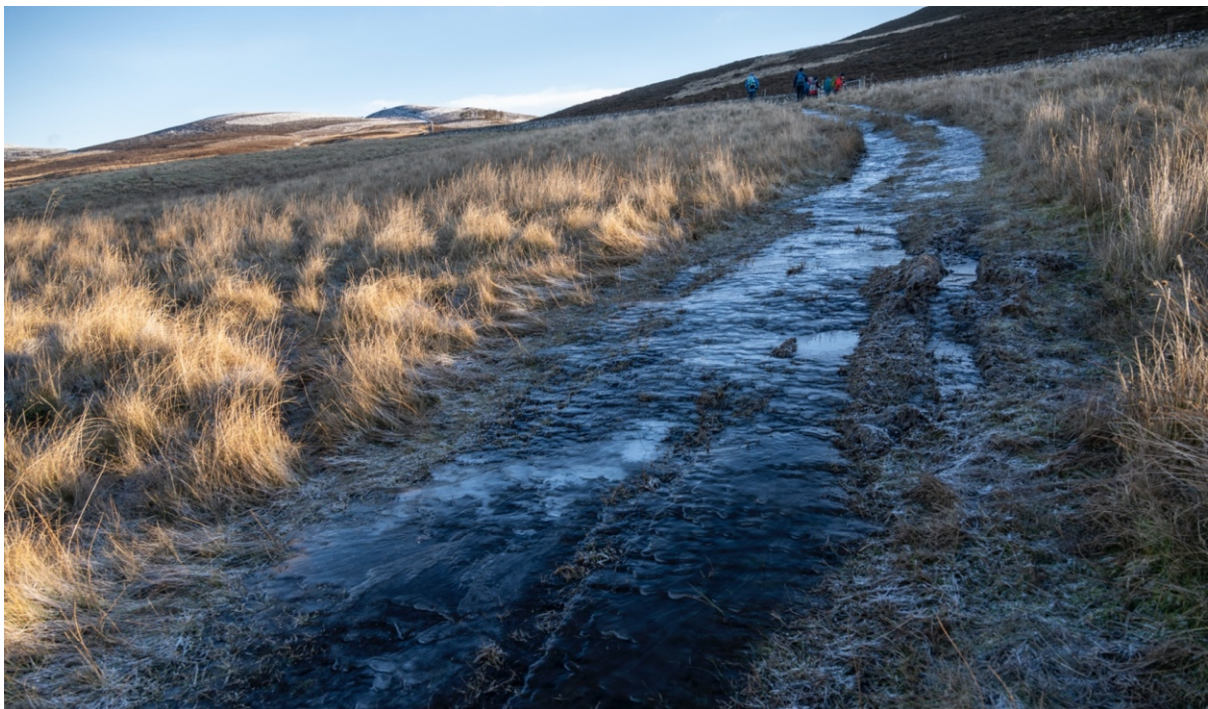
Ice dominated the track