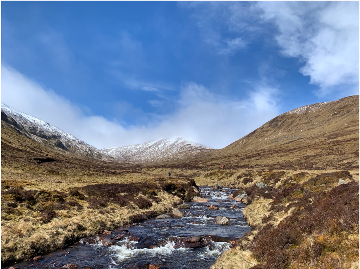
Along the valley of the Allt Odhar the sun comes out