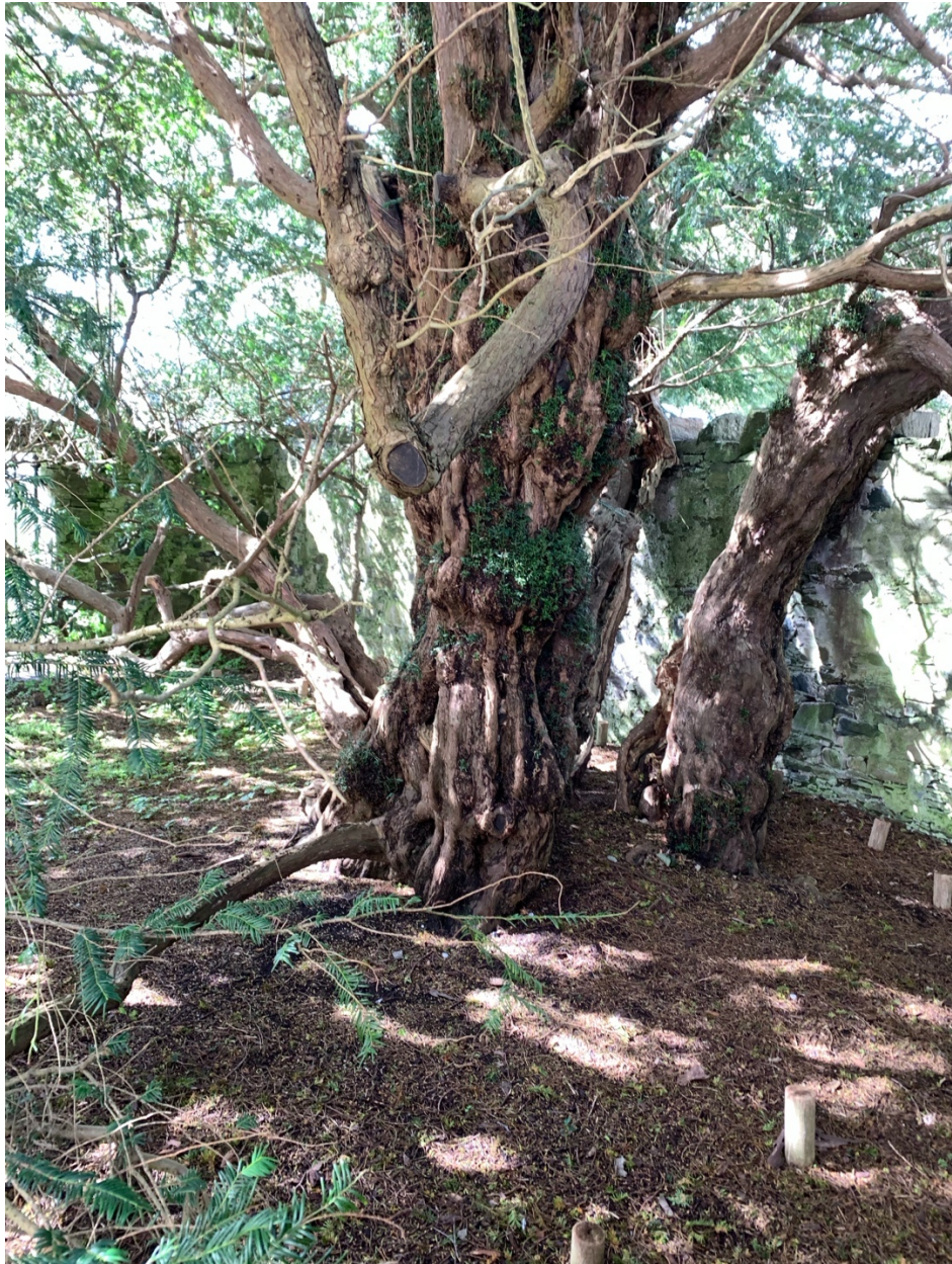
The Fortingall Yew