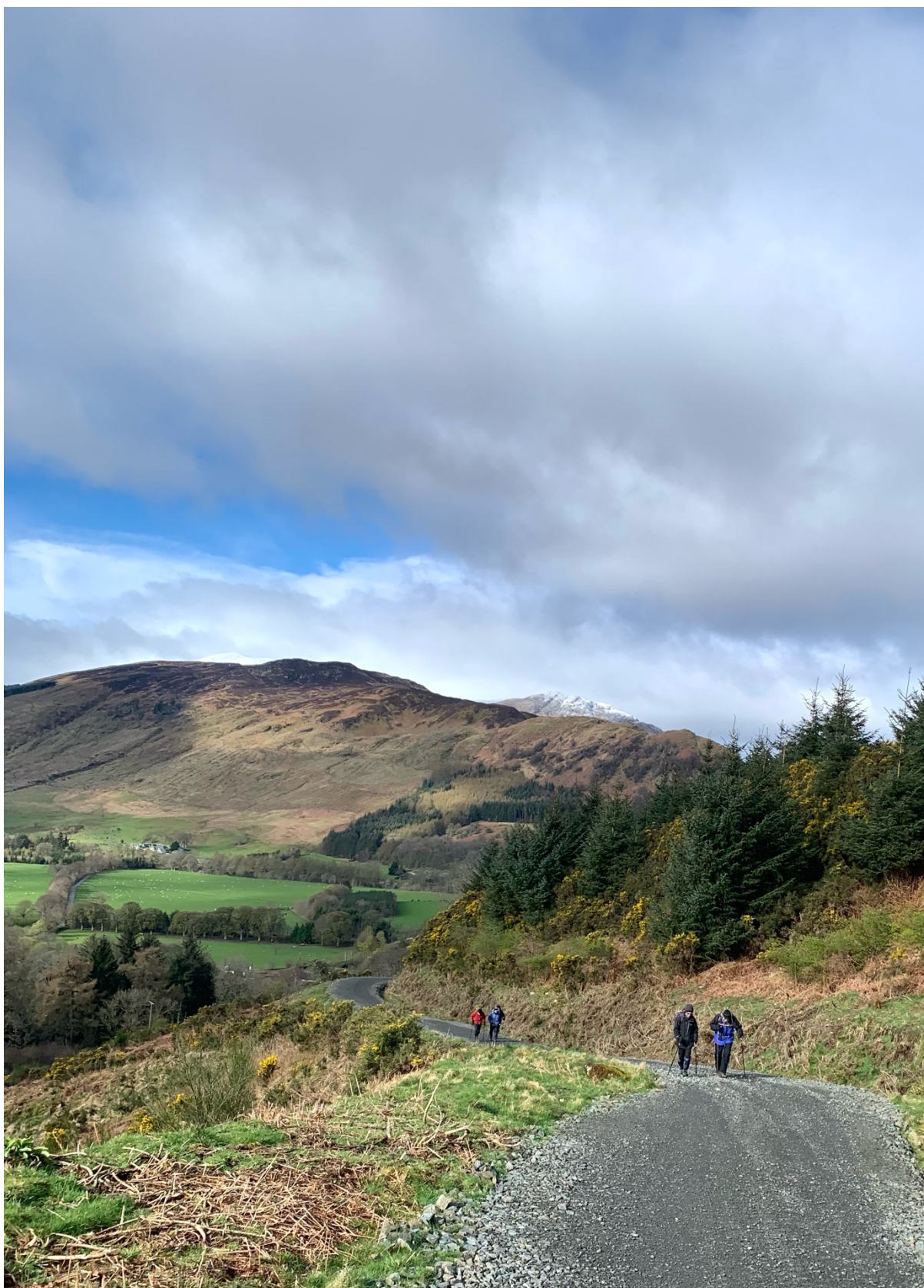
Close to the start of the walk on the estate road