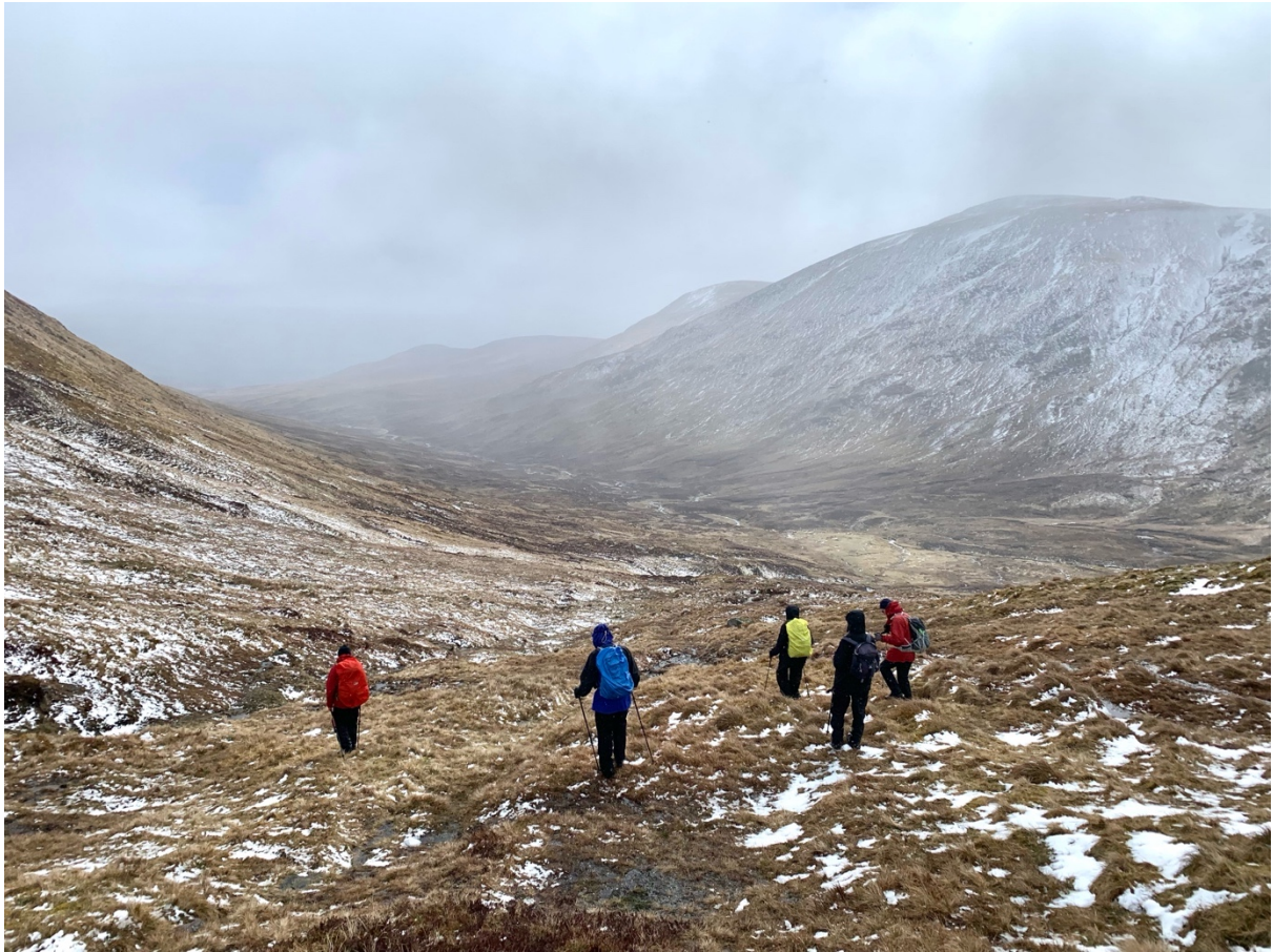
After deciding that the wind is too extreme we descend down to the valley