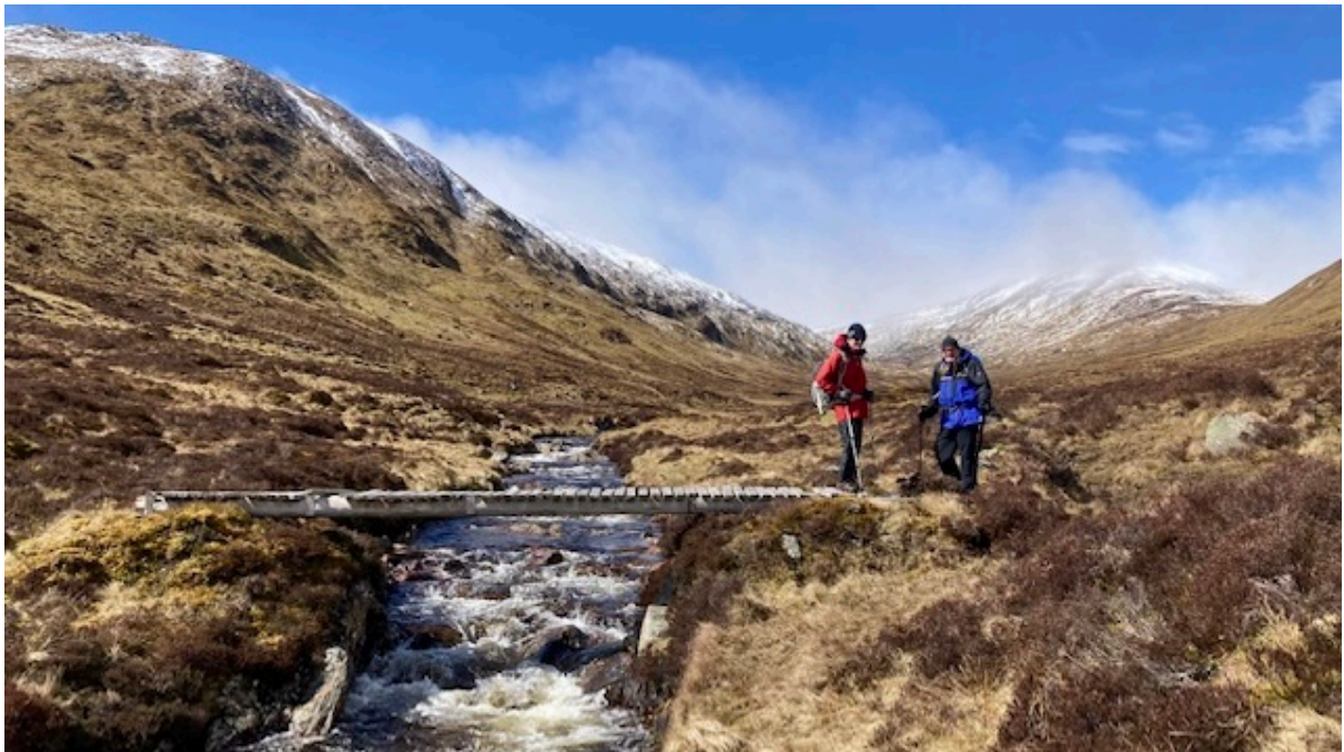
The decent can be made on either side of the burn and near the lower slope a bridge provides a useful link to gain the main path back to Fortingall.