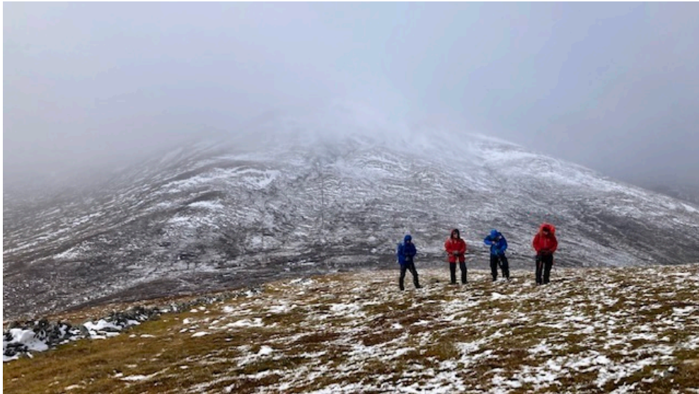
Part way along the ridge and the wind becomes an issue