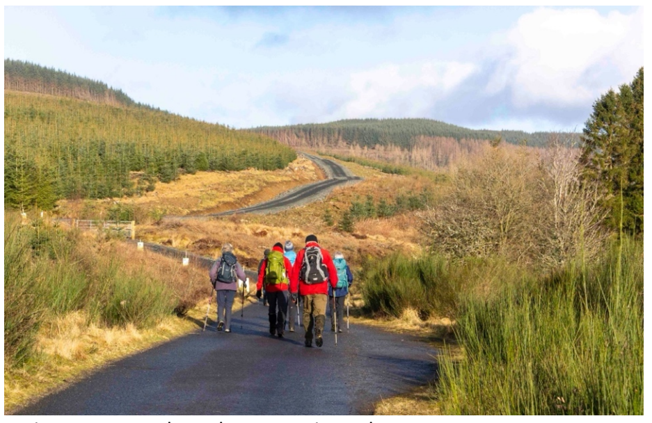
A nice easy start along the reservoir road