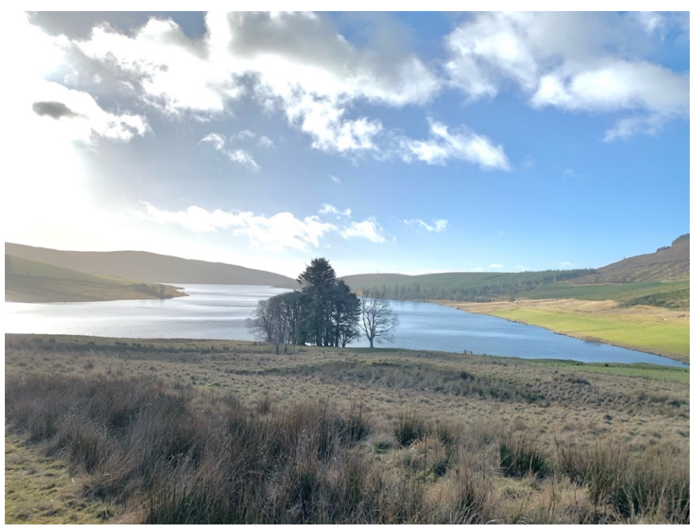
At the end of the Reservoir looking back