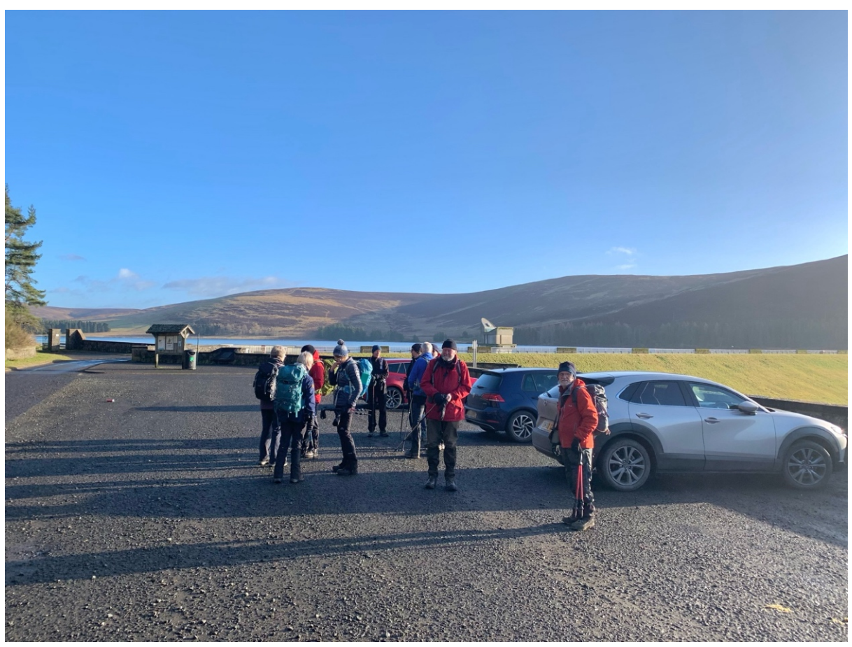
At the walk start next to the dam wall