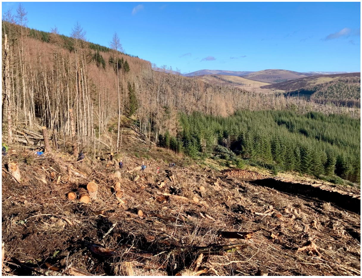
We clamber up a very muddy extraction track