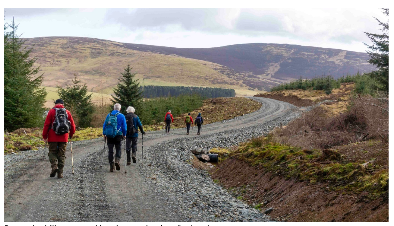
Down the hill on a good logging road – time for lunch