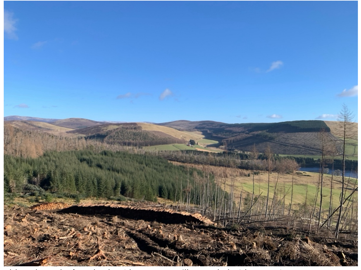
Although we don't make the ridge, we are still rewarded with great views