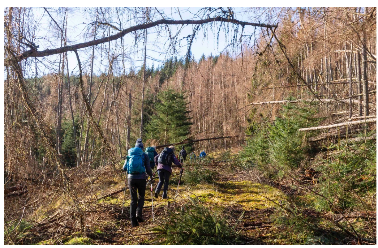
Looking for the path to the ridge