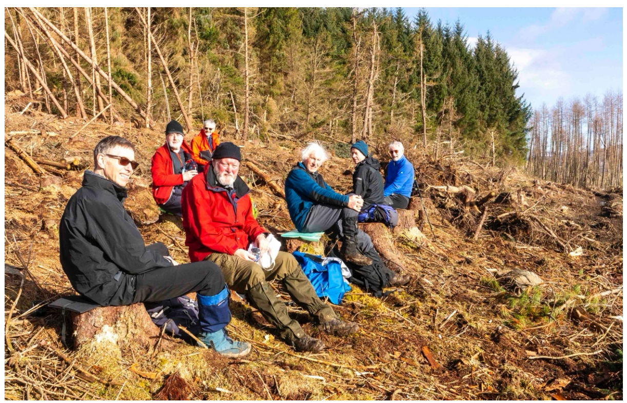
Time for coffee