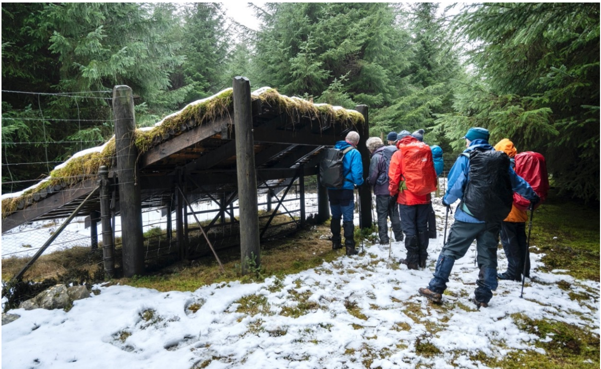
Discussion on the purpose of this rather strange shelter. The deer fence goes through the middle of the structure making its use as an emergency shelter limited.