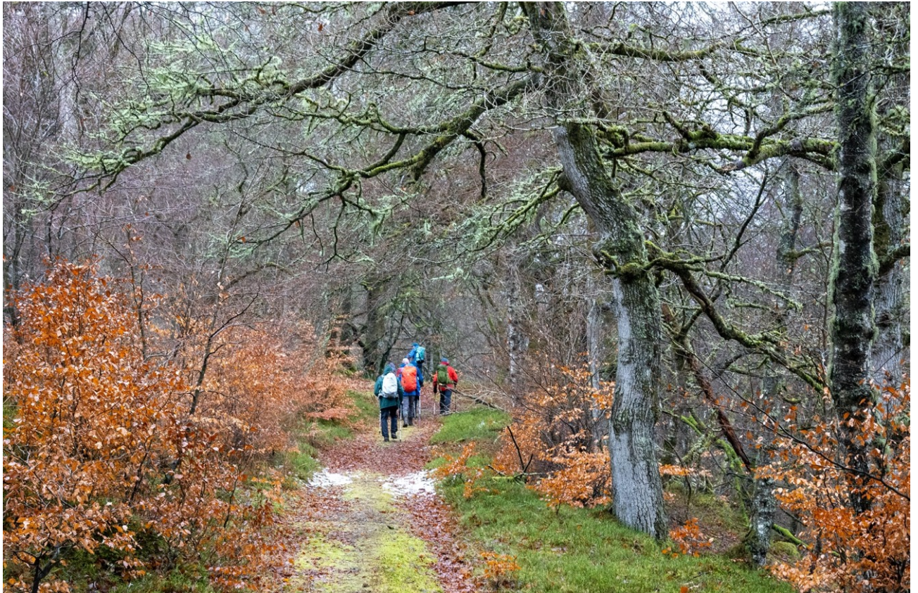
We enter in to the woodland with the Turret burn to our right