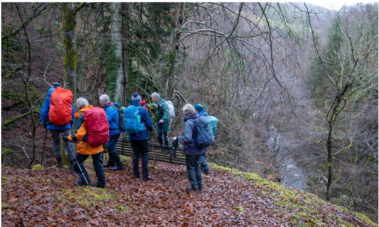
Higher up the Falls of Turret come into view down with the deep gorge that runs along the path