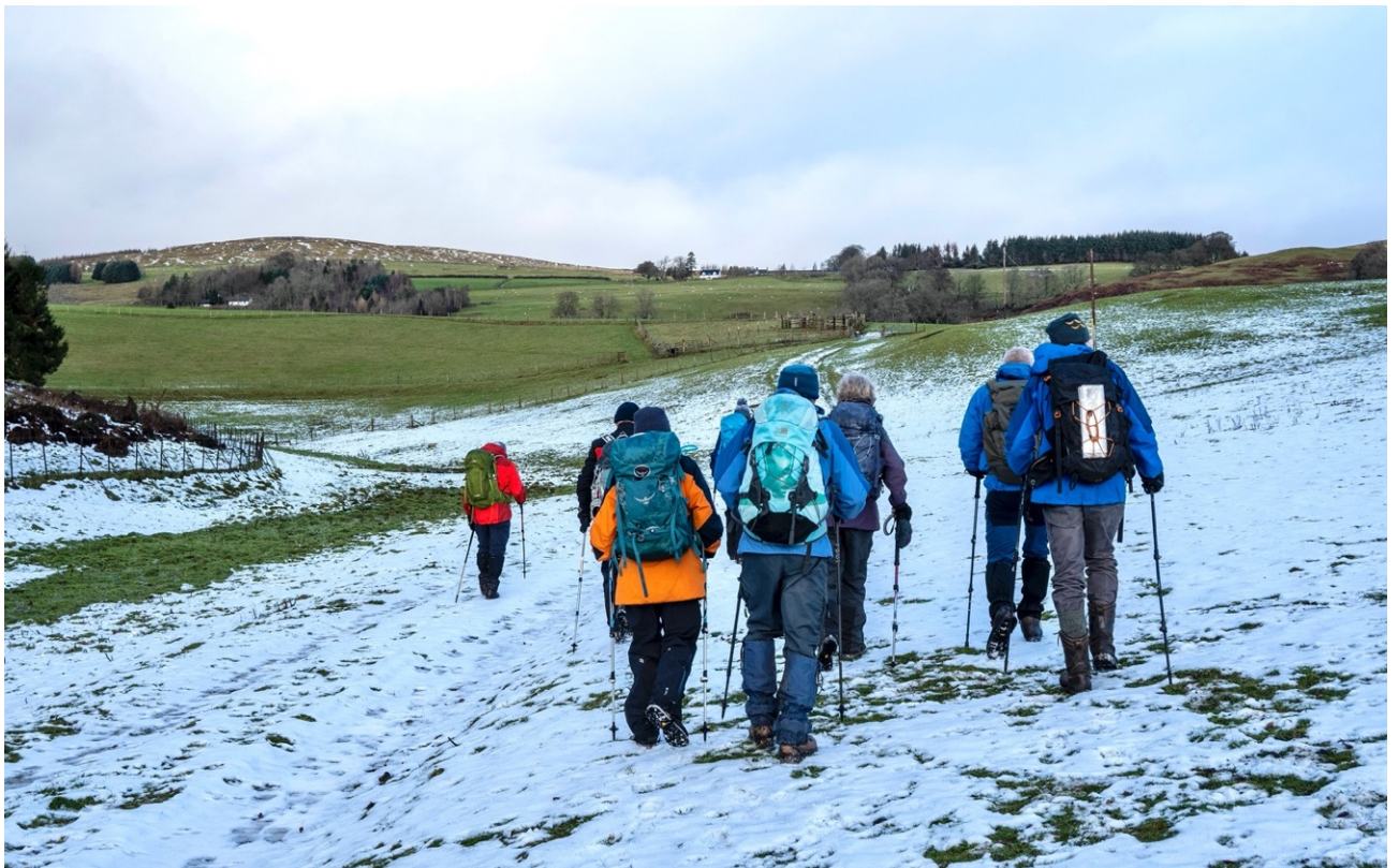
After leaving the distillery at Crieff, we head up the hill towards Greenend Farm