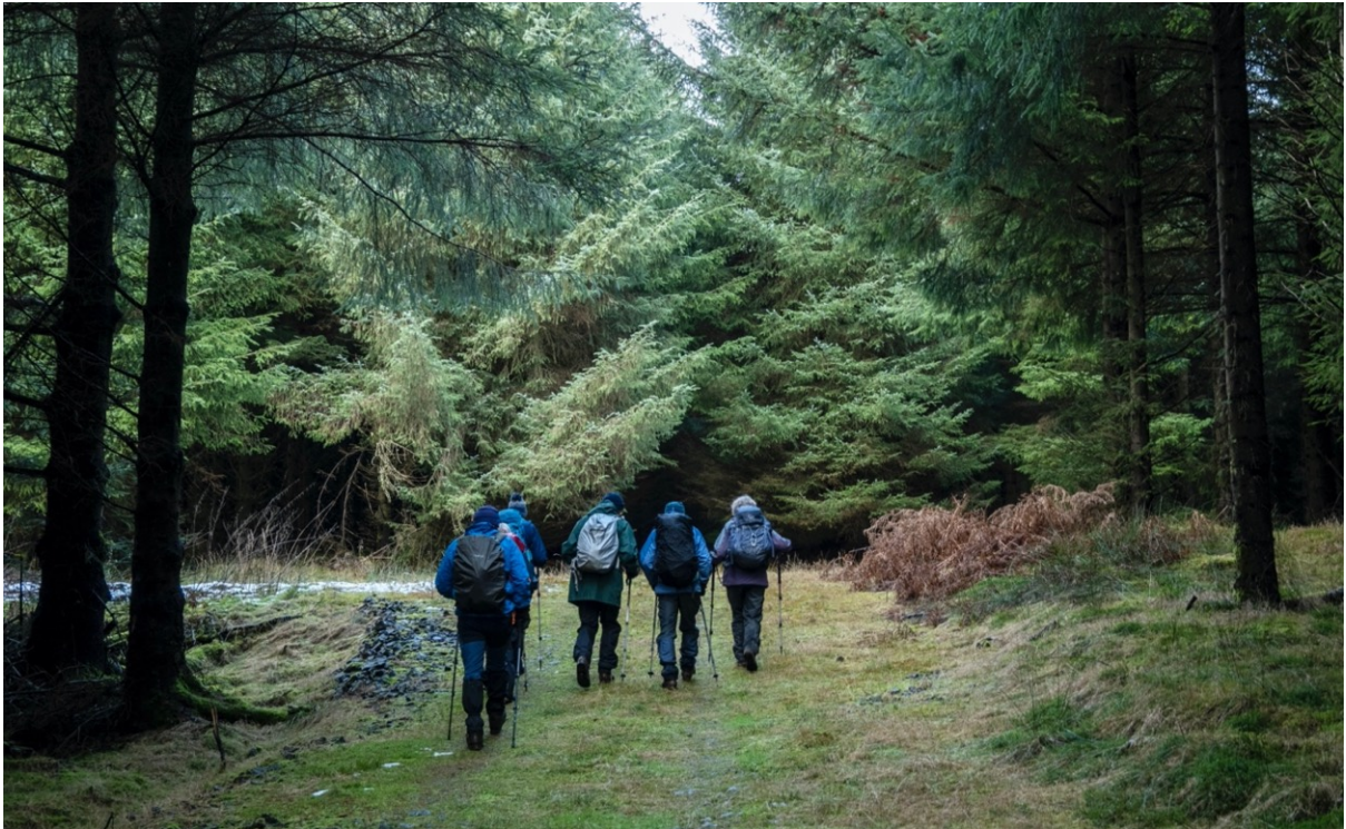
Following a coffee break we enter into the plantation following a series of forest rides