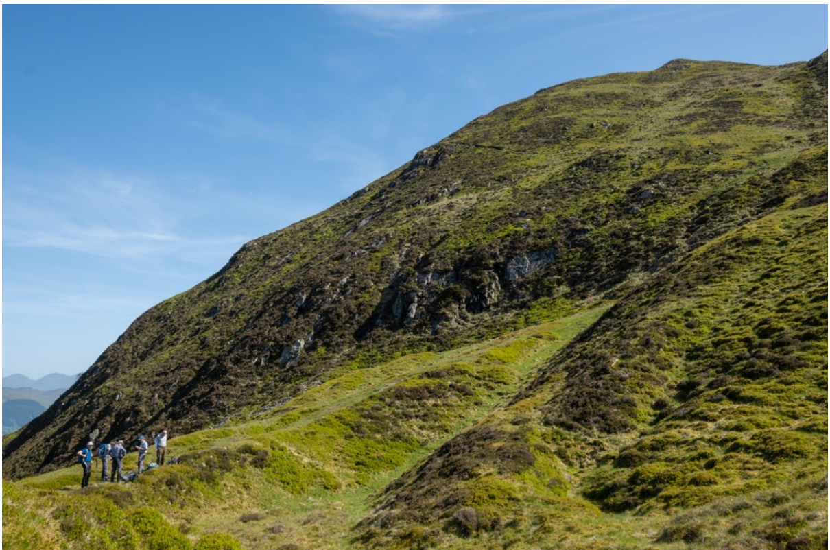
Time for a quick breather