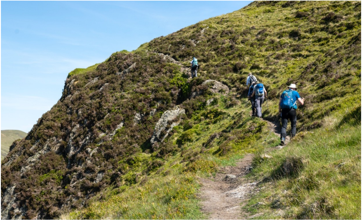
Starts to get steep and the sun is pretty warm