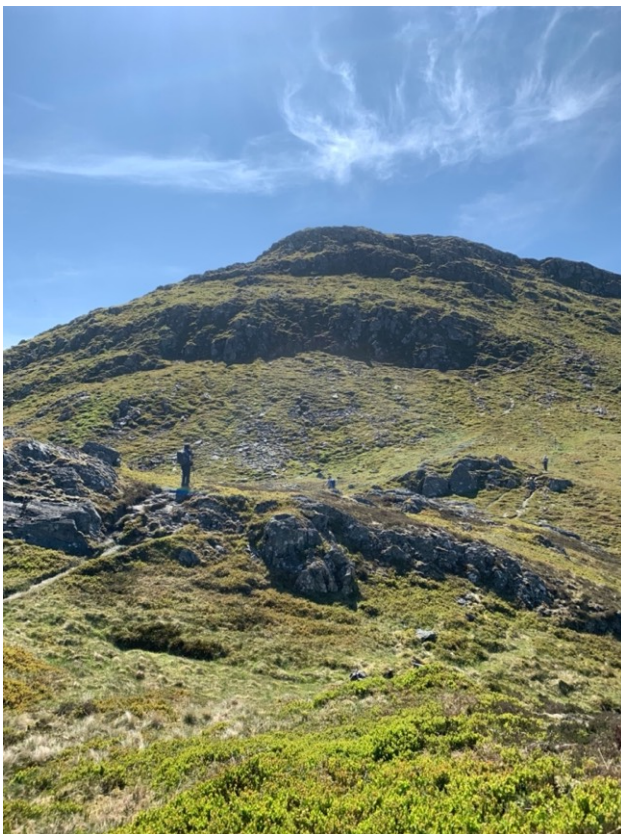
After leaving the summit we commence the decent using a different route