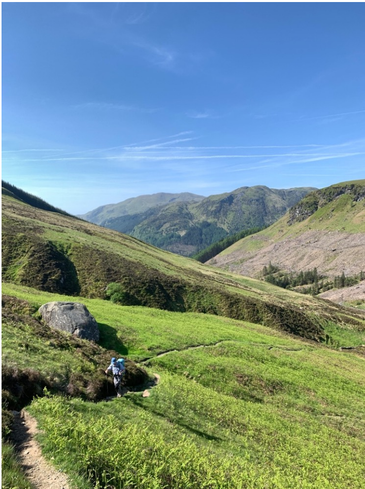
Starting the climb up the lower slopes.