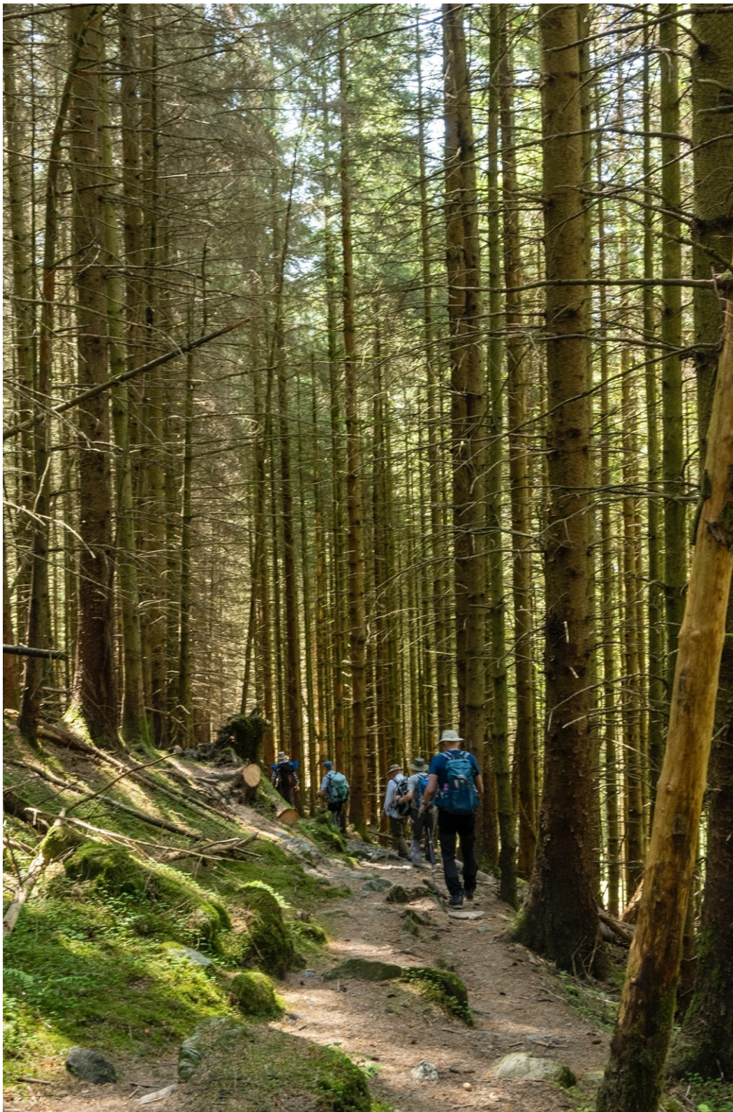
After leaving the open hillside we continue the return to the road through the plantation