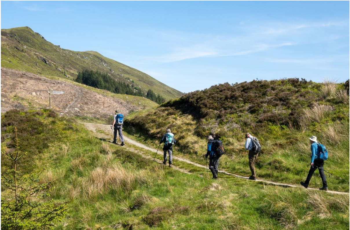
After leaving the lower woodland we start on the open hill