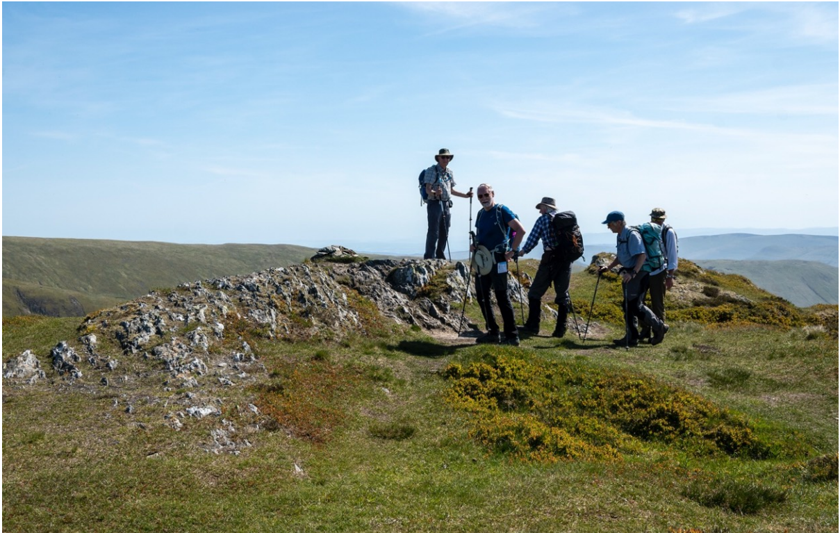
The summit at 813m with its very diminutive cairn