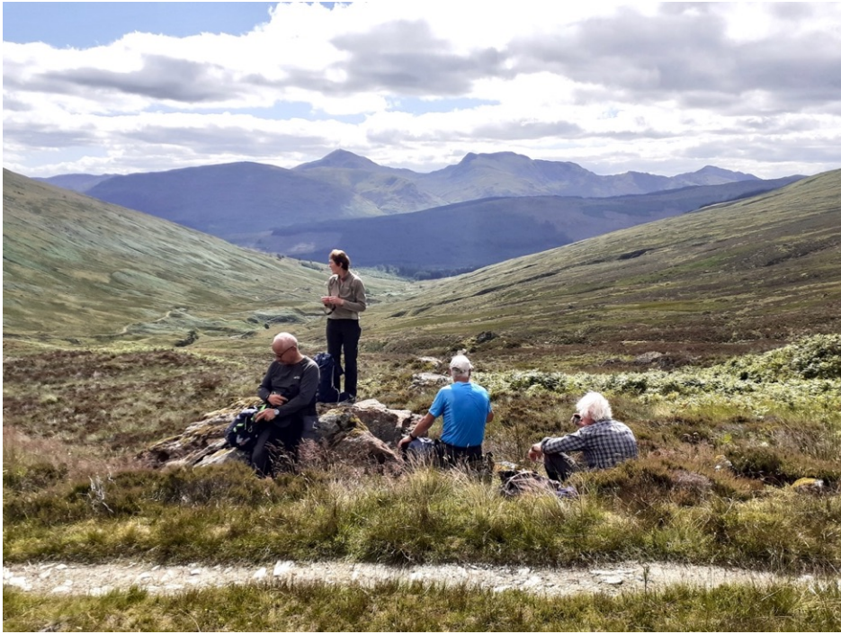
Coffee-stop before the main ascent