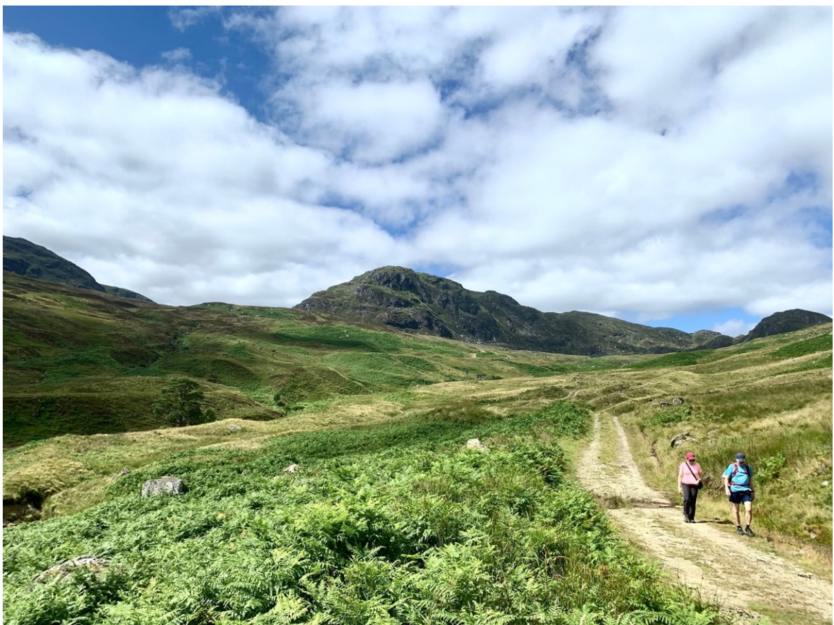
A last look back at Creag Mac Ranaich