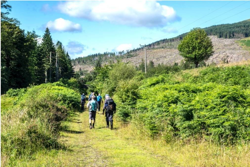
At the start of the walk