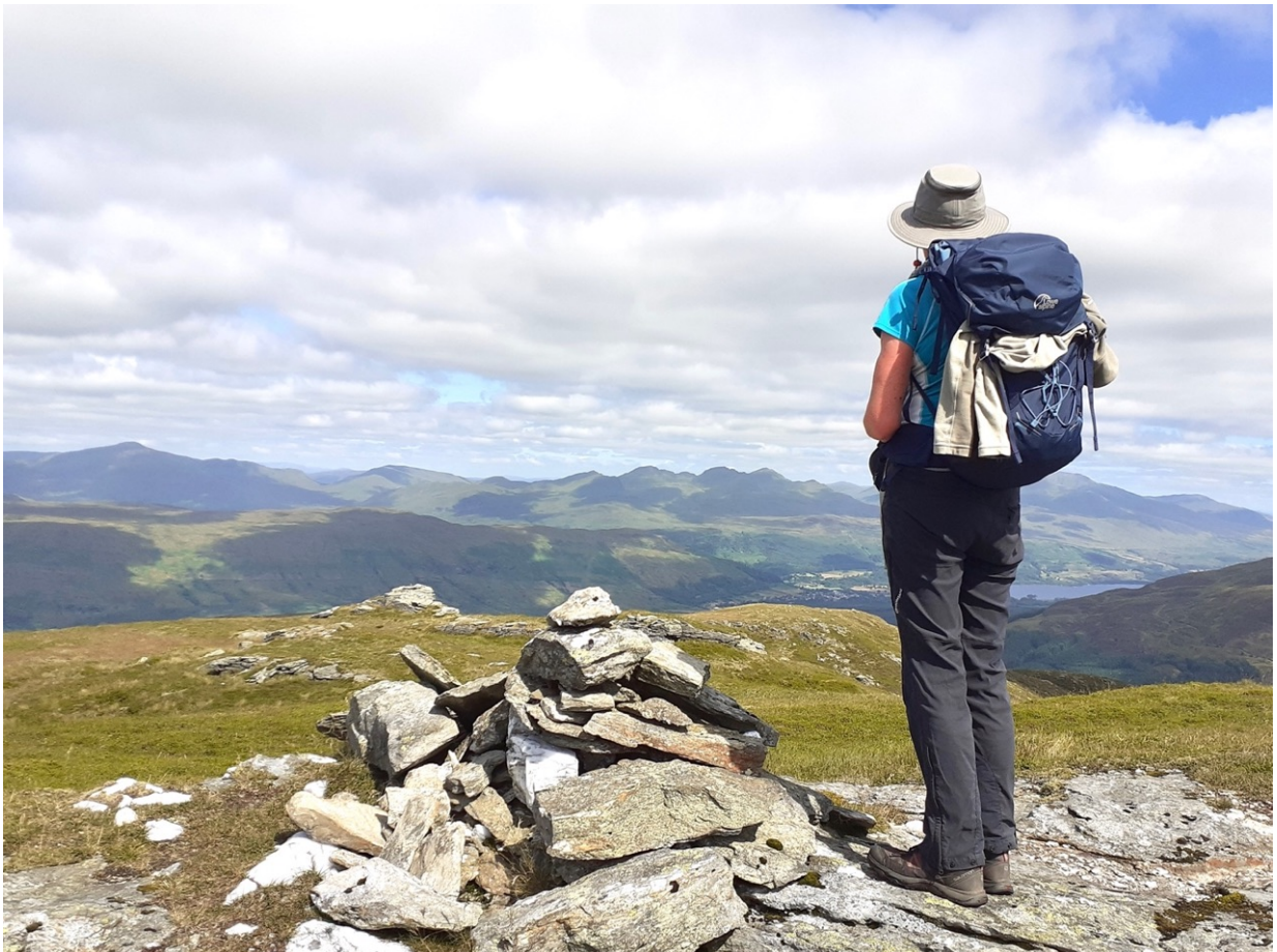
Time to take in the view