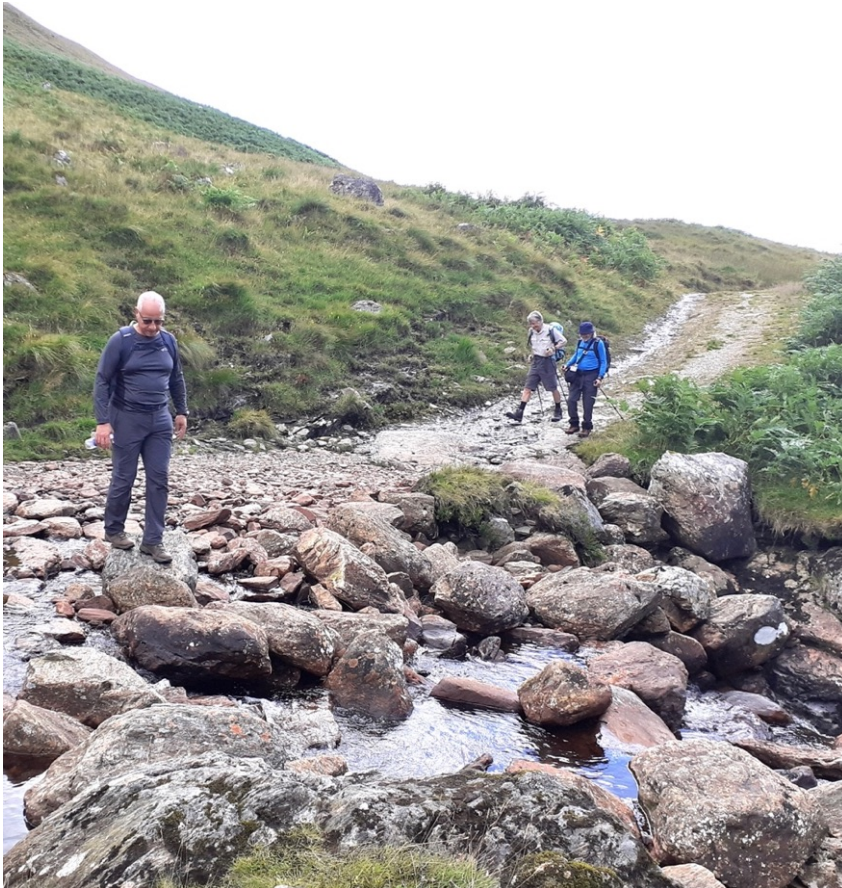
A crossing point. Fortunately, with the lack of rain, the burn causes no holdup