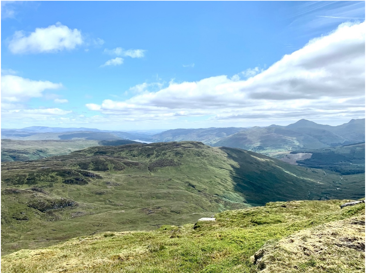
Another view from the summit