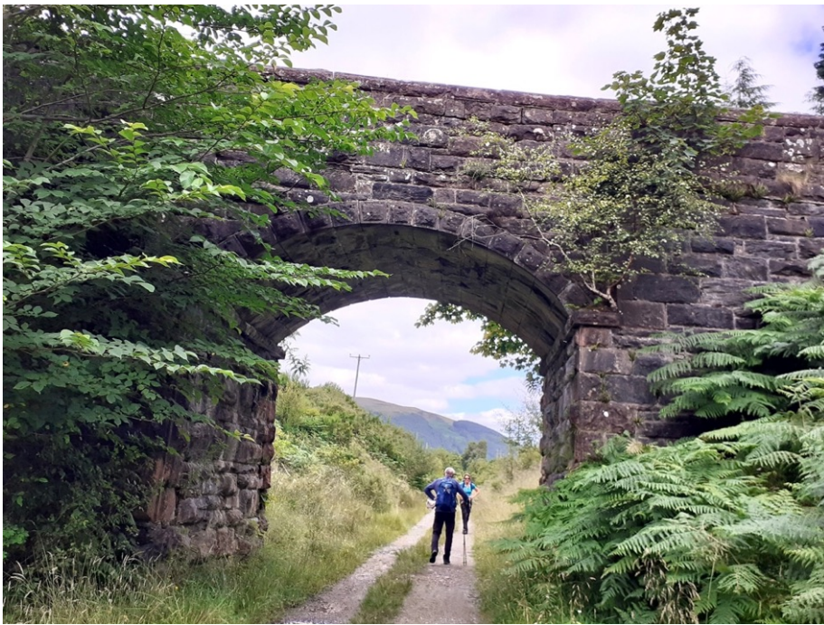
Our path runs along the top of this old bridge