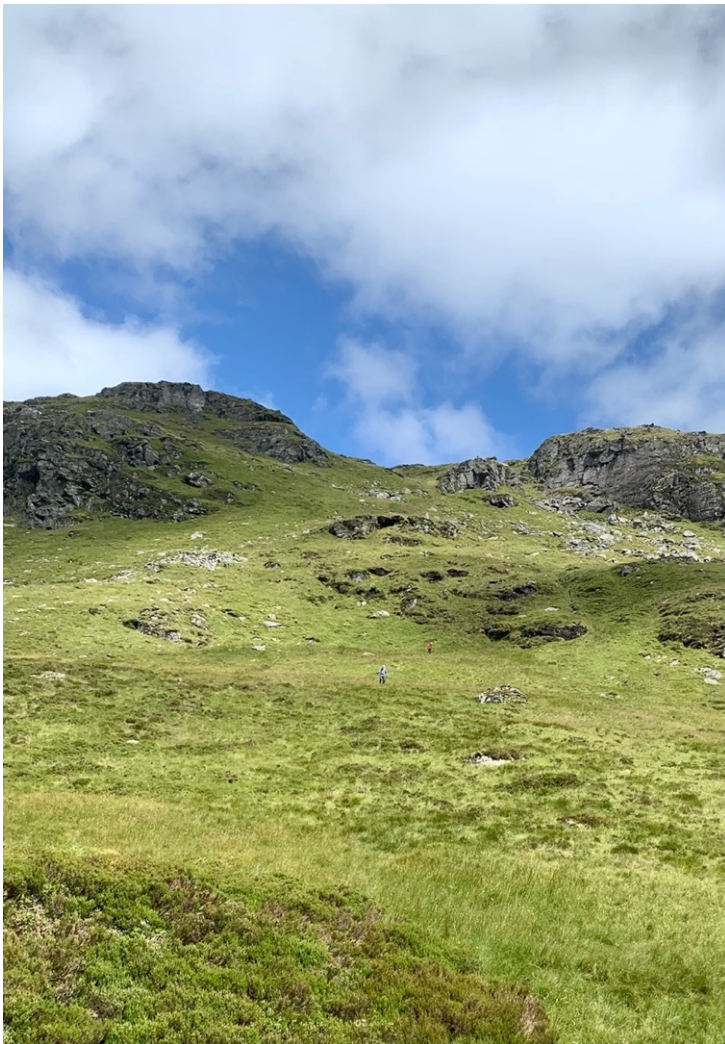
The way up and the way down