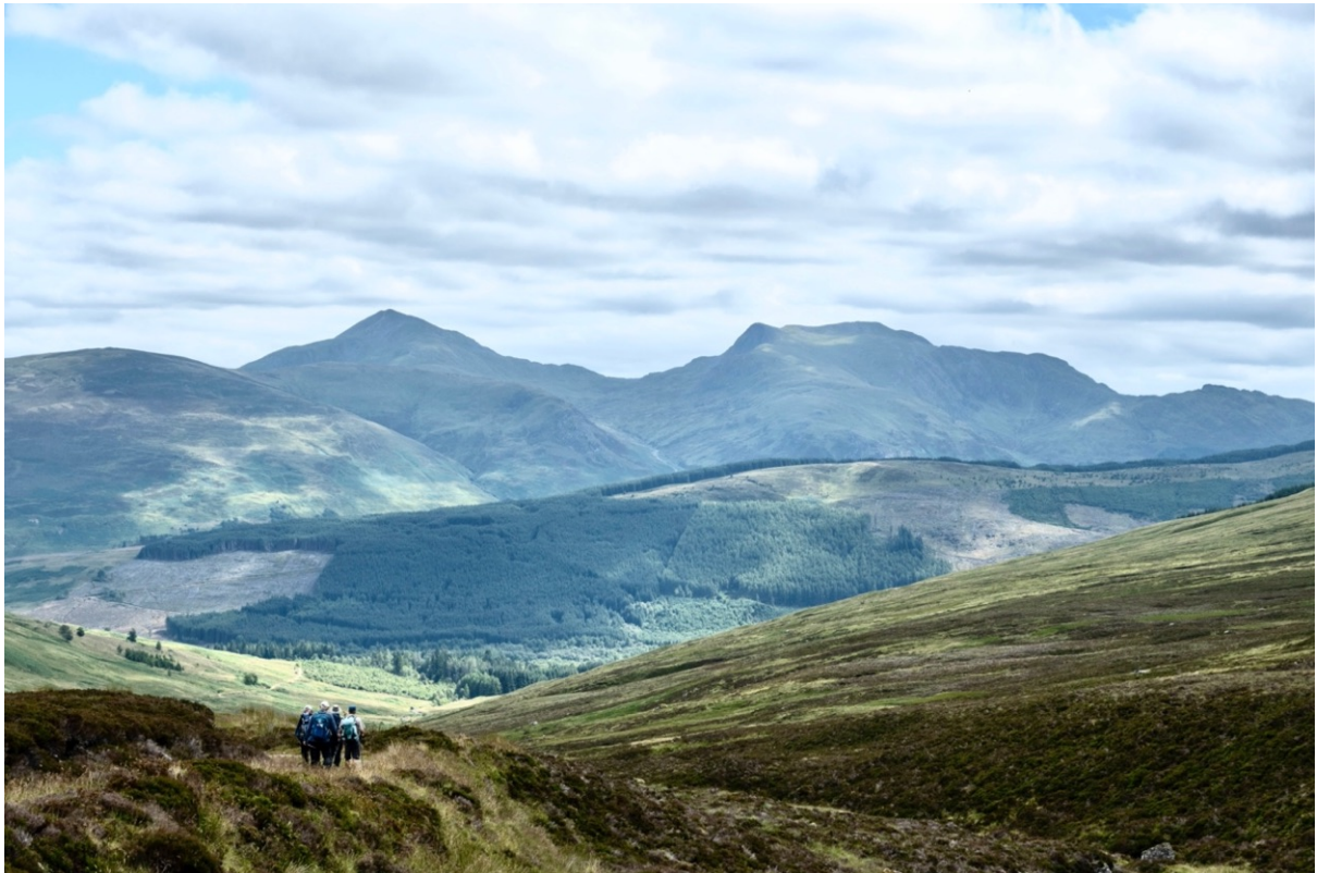
Dropping down the hill