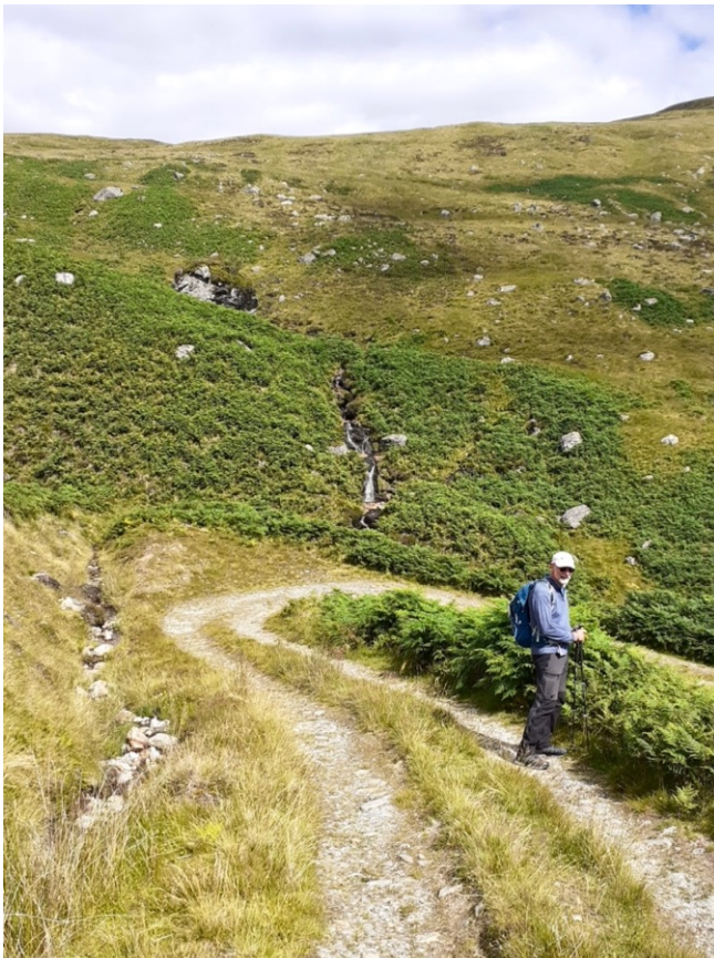
On the return path down the hill