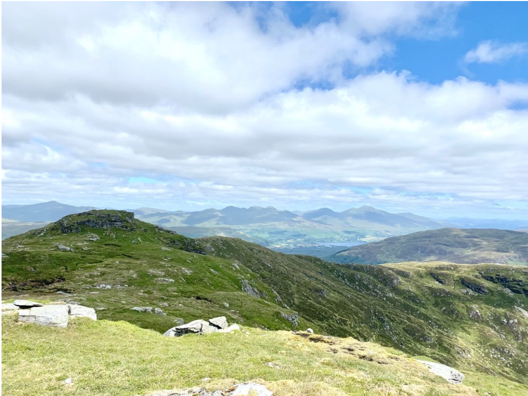
At one of the two summits on Creag Mac Ranaich, looking over to the second summit