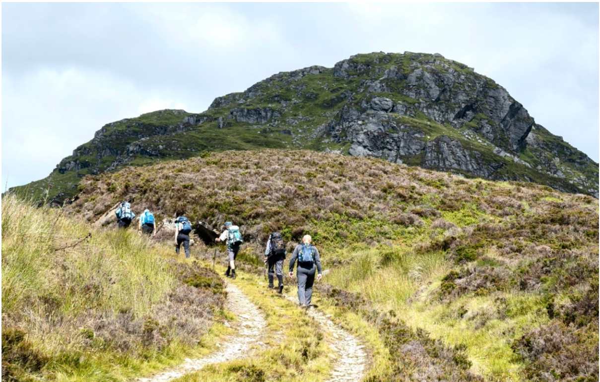
A gradual climb up on a very good path.