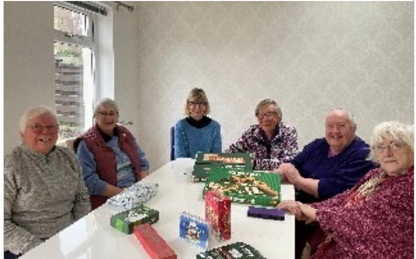
Fun and Games group at play.