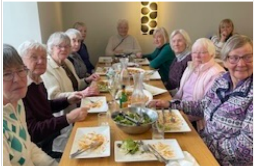
Theatre group at work?