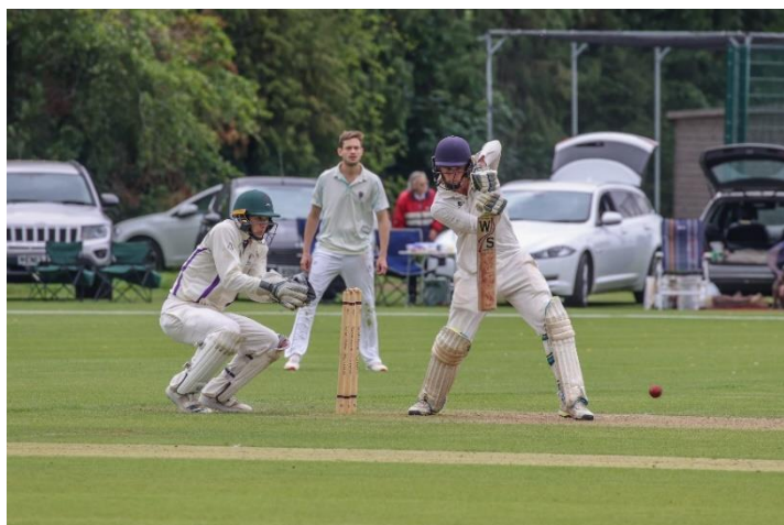
showing Oundle Rovers v Eton Ramblers