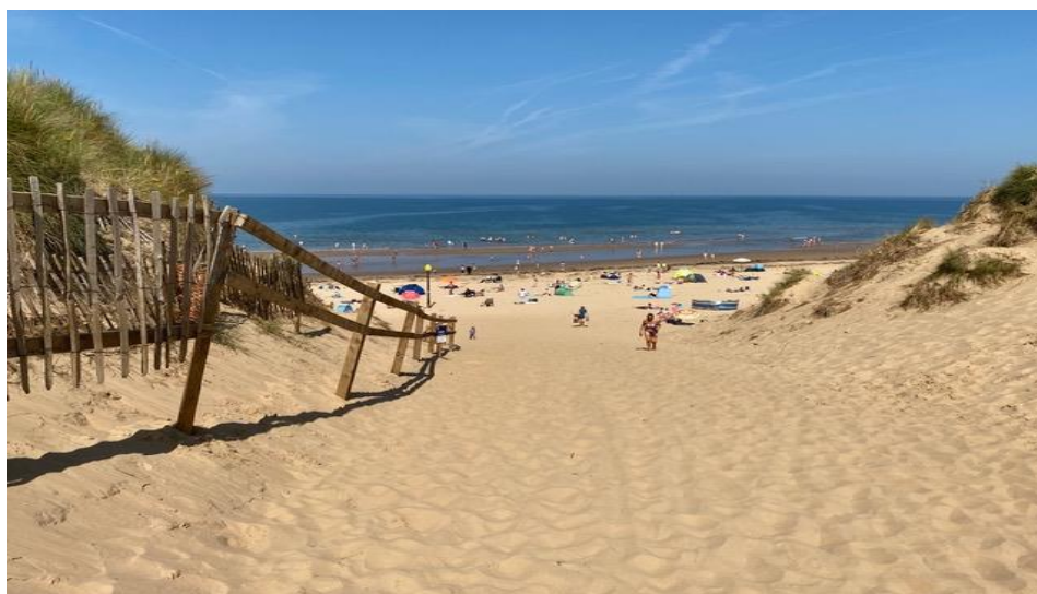
Formby Beach near Merseyside by Geoff Harrop