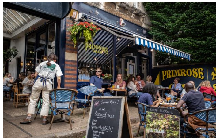
Café culture in Clifton, Bristol (right)