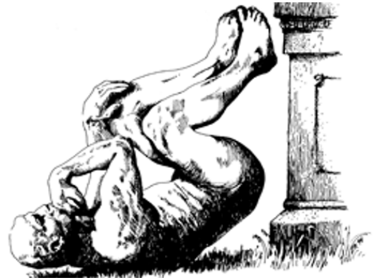
The Stinker: Official Mascot of the Ig Nobel Prizes

We will discuss these awards that "honour achievements that first make people laugh, and then make them think. The prizes are intended to celebrate the unusual, honour the imaginative — and spur people's interest in science, medicine, and technology."