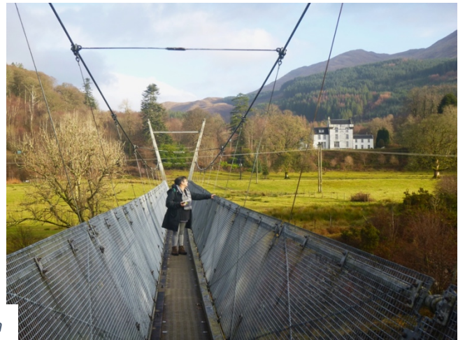
Inverawe - Liz Eaton

We are going to meet at Taynuilt railway station at 11am on Wednesday 31 January 2024. The walk is gentle up and down and muddy. We are going to have lunch at the Sìtheag, Inverawe. There is a footbridge which might be wobbly depending on how many people come, see: photo