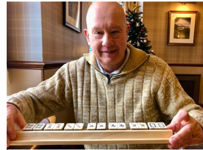
A special hand Mahjong!

We have been delighted to welcome two new members, both of whom are doing well and enjoying it I think. We continue to meet in the Royal Hotel every Monday from 2-4ish. All welcome and you don't need to have had any previous experience. We will resume play on Monday 8 th January.