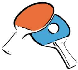
Table Tennis Group:

This group meets at 2pm on Mondays, in the games hall of Atlantis Leisure. After an athletic hour we adjourn to the café for herbal tea/ cappuccino/cake...each according to need!