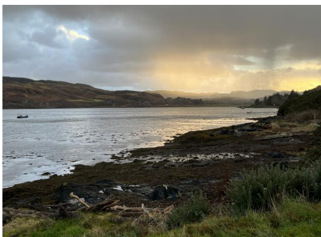
Ardentallen Joan Kemp

Before Christmas Central u3a informed us that because of Covid they were forecast to have a shortfall in funding and would need to increase subscriptions. The proposal was that they should in future be index-linked to pensions. We and many other branches objected strongly to the idea of something which only the government should be able to do. As a result, they have withdrawn the idea, have promised to make their workings more open and reacted positively to the suggestion that there should be better two-way communication between the centre and the branches.