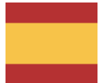
Table Tennis Group:

The Spanish group meets in the Lancaster Hotel at 11am on Wednesdays. We have some structured, prepared sections and we also try our best to have conversations. All levels of Spanish speakers, including beginners, are welcome.