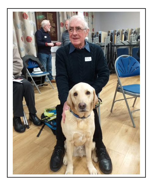
From History & Archaeology group