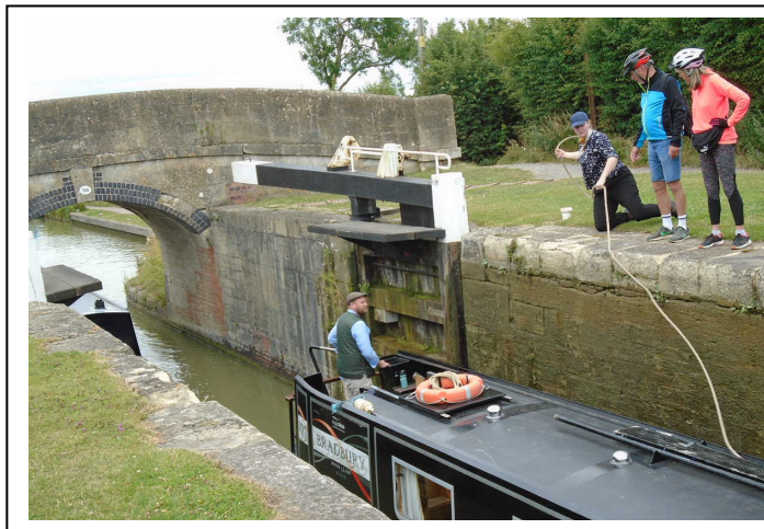
The canal near the Barge Inn, to help get you in holiday mood!