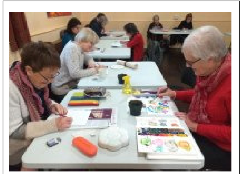
The Art group hard at work!