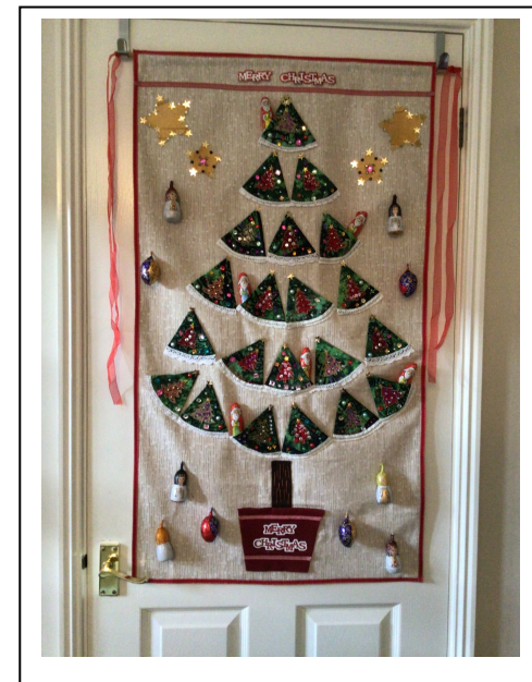
Festive door-hanging made in the Common Thread group

Cover: In West Woods, Marlborough, Photo by Sue Taylor