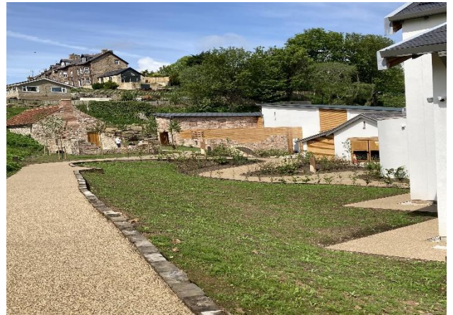
The outside area, which is part of the Distillery Tour

For further information and/or to reserve a place please contact Cecilia Coulson cecu3a@gmail.com or phone 07881768301