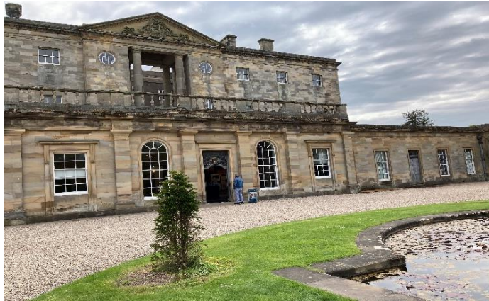
Cecilia Coulson - Whickham and District u3a.

Gardens were magnificent, azaleas and rhododendrons in full bloom, church tapestries inspiring, and the hall was inspirational ... a piano playing classical music in the Chinese room.