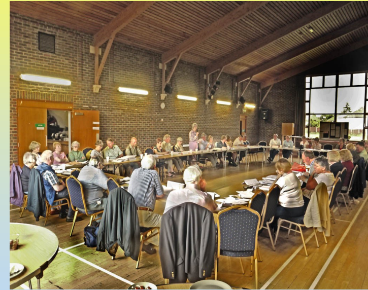
Hertfordshire Network meeting