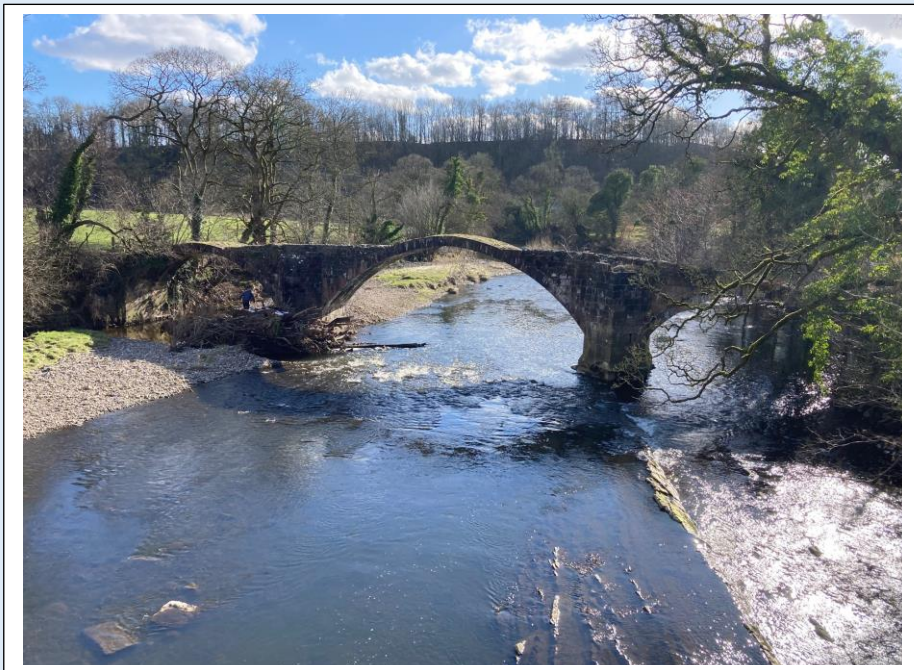
Hodder's Bridge, Clitheroe