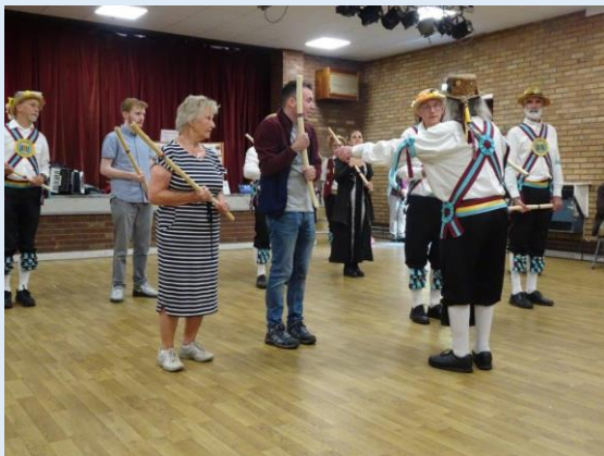
Lymm & Thelwall Members learning how to Morris Dance.

Events took part throughout September, including investigation of the history of their village by children at junior school, heritage crafts, walks, pebble painting, Wellbeing weekend and coffee mornings cumulated in a full day around the Parish Hall and Sunday's Thanksgiving service at All Saints Church. It was a wonderful day to share the activities of Lymm & Thelwall u3a.