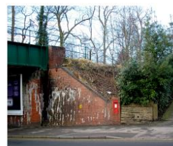
Railway Bridge, Bramhall Lane South