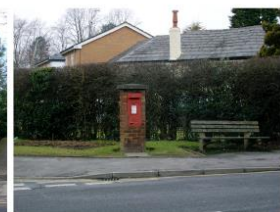
Robins Lane / Bramhall Lane South