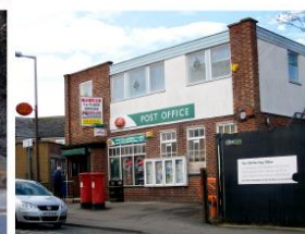
Post Office, Maple Road