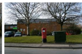
Shops, Dairyground Road