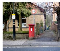
Centre Point, Bramhall Lane South