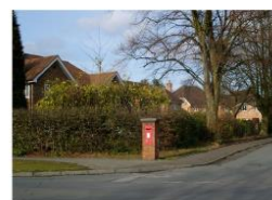
Ladythorn Road / Ladythorn Crescent