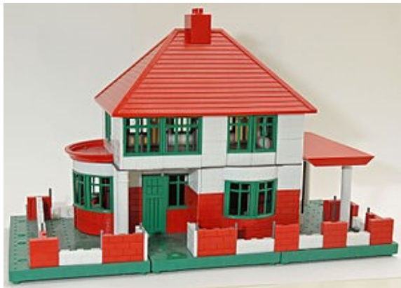
A model of a detached house built from a 1950s Set 3.

Over its lifespan, both Plimpton and Meccano Bayko was exported across the world, and, from initially being a toy, it later attracted a modest adult following that increased after the brand was discontinued in 1967. Any serious BAYKO enthusiast will have a substantial collection of parts and will be a freelance designer and architect, producing unique and interesting models. For this large – and, indeed, predominantly – adult following, there is a Collectors' Club and a number of recognised dealers in second-hand parts and sets.