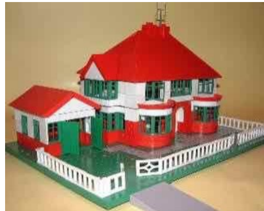
The model to which all aspired! Built from Set 4

An entirely new range of products appeared in the first decade of the 21 st century and commercially produced plans for bigger and better buildings are in production. However, the real joy is one of creativity, using a large collection of component parts to produce something unique. There is a decided parallel with the hobby of completing jig-saw puzzles, although, of course, that hobby produces only one set result for each puzzle completed.