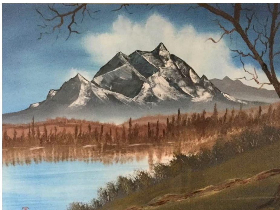
Calm Waters by Ian Lumley

A MISCELLANY OF CONTRIBUTIONS FROM OUR MEMBERS