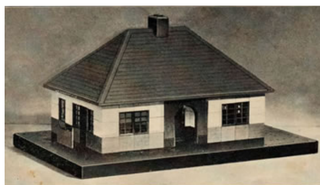
Pre-war model – note the dark colouring and thick base

In the original sets bases and roofs were brown; walls were brown and cream; and windows were a very dark green, but by 1937 the 'true' colours of red and white walls, light green windows and red roofs were established, though bases were still brown.