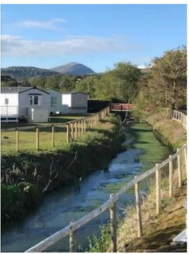
Room with a view (Croyde) and balcony with a view (Porthmadog) – our May holiday venues

A MISCELLANY OF CONTRIBUTIONS FROM OUR MEMBERS