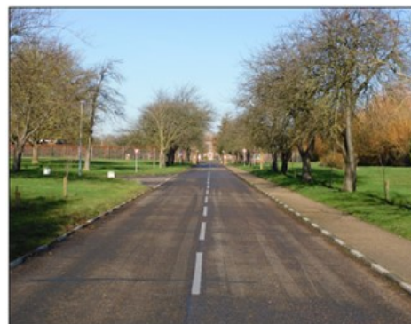
Entrance to RAF Waterbeach

Parking: Easy on site parking. There is a long straight drive at the end of which is a barrier that is raised by a guard who salutes you to allow you to enter. Inside, the RAF museum is ahead and to the left, the Royal Engineers museum is to the right.