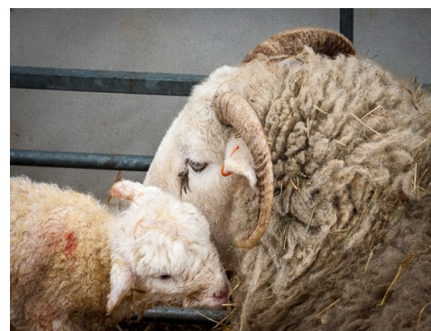
"Lamb and Mother"