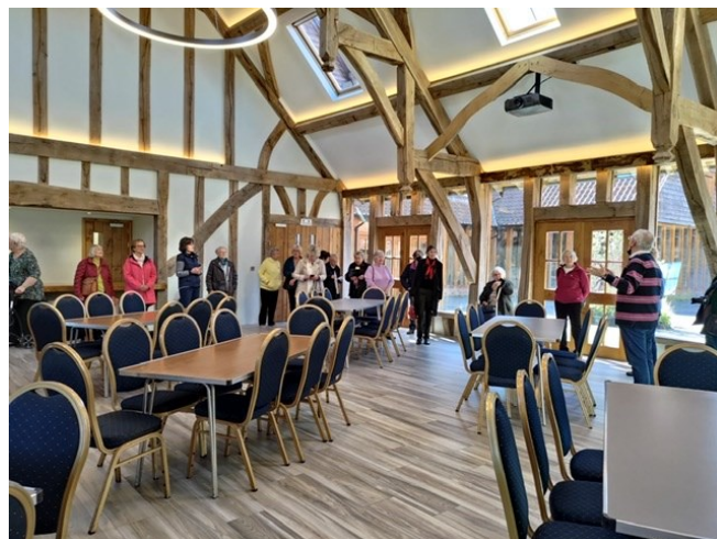
The MOTO group at Isleham Church