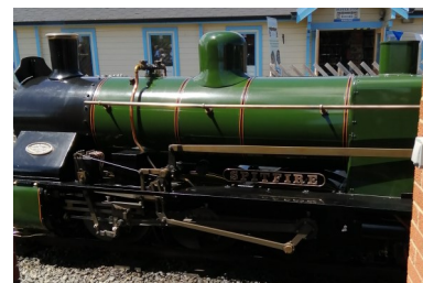
LEFT: Steam engine 'Spitfire' at Aylsham

On Monday 20 June, 47 intrepid U3A travellers set out for a day in Norfolk, to travel on a miniature railway and a paddle steamer. The weather on the day was perfect and the arrangements ran like clockwork. The railway journey was first, travelling gently through the Norfolk countryside at a stately pace on a calm and sunny morning. This was followed by lunch at an individual choice of venues, before boarding the Southern Comfort for the afternoon voyage along the Broads. Again, the gentle motion of the boat, the warm sunny afternoon and the recent lunch all contributed to a lovely restful afternoon. We are grateful to Niddy Walpole for her organisation of yet another very successful trip. Where shall we go next year?