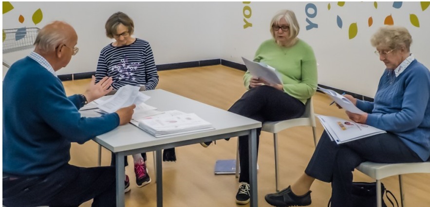
ABOVE: DRAMA rehearsal. The group is currently 'resting'

In the summer of 2021 the lockdown began to be lifted and our groups began meeting Face to Face again. All the pictures on this page were taken after the pandemic, when face to Face really became a significant time. Of course it didn't all happen at once and we are still moving forward. Things are changing: some groups, (e.g. Drama) have ceased to function at present, while others are running with renewed energy.