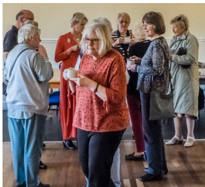
ABOVE: The inevitable tea and coffee: An integral part of every group meeting, and yet now a great opportunity to meet members, to chat, to exchange stories, to enjoy the company of others

In the summer of 2021 the lockdown began to be lifted and our groups began meeting Face to Face again. All the pictures on this page were taken after the pandemic, when face to Face really became a significant time. Of course it didn't all happen at once and we are still moving forward. Things are changing: some groups, (e.g. Drama) have ceased to function at present, while others are running with renewed energy.