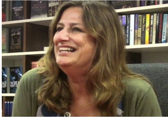
Elly Griffiths: Copyright © Elly Griffiths 2020

In February we started off with the novel "The Crossing Places" by Elly Griffiths.