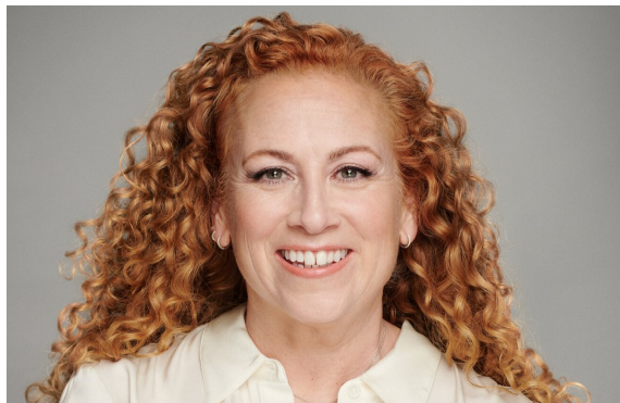
Jodi Picoult

This will be followed on the 25th March by "Wish You Were Here" by Jodi Picoult, which was chosen partly because it portrays someone facing isolation due to the Covid situation.