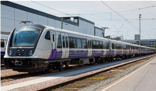
Our April and June

We started 2022 with a film show covering Grafham Water, the Liverpool to Manchester railway and the current Spitfire exhibition at the Imperial War Museum at Duxford, all representing aspects of Wheels, Wings and Water.