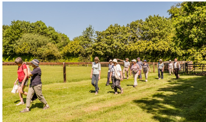
Spring time is just around the corner! We feature the Walking Group striding out on a sunshine walk in Ashley, during June 2021. Hopefully we shall soon be out again in similar weather.