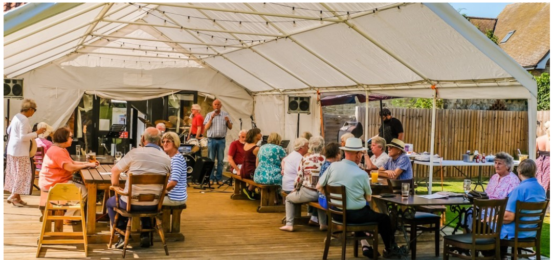
ABOVE: 2021 Summer Barbecue - a celebration of the freedom to meet