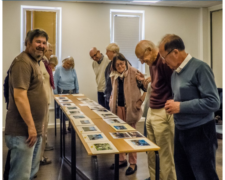
BELOW: Camera group choosing the winners