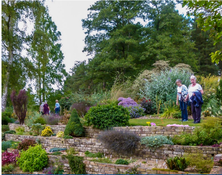
ABOVE: MOTO (Members on their Own) enjoy sun and scenery