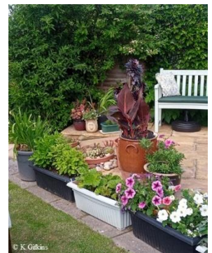
Ann Cant's garden - Isleham

The event proved to be a success with some gardens being visited by up to 40 people and resulted in at least two new members being recruited. The only negative comment we received was that there was not enough time to visit all the gardens, which were spread over most of our catchment area.