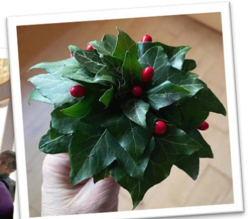
“Nimble fingers required...”

Post Christmas meal – There was no turkey with all the trimmings, nonetheless the group tucked into a hearty meal while catching up on the latest news.