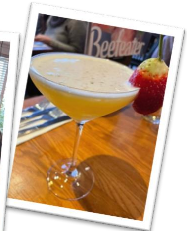
“Dessert or starter?”