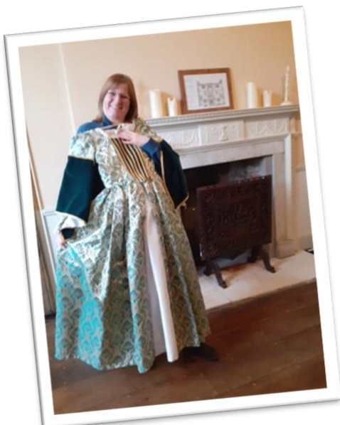
National Trust Group