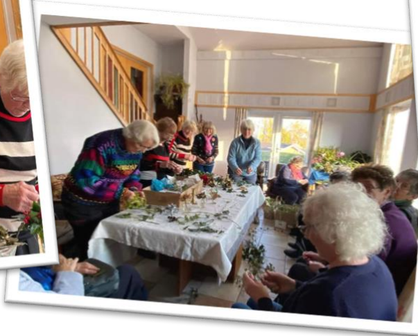
“The group are let loose to get creative”