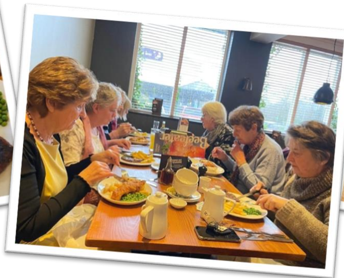
“Hope you’re hungry!”