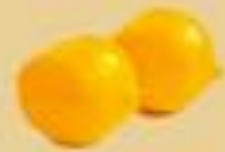
2 lemons (juice and rind)