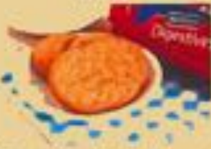
115g digestive biscuits