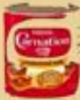
small tin condensed milk