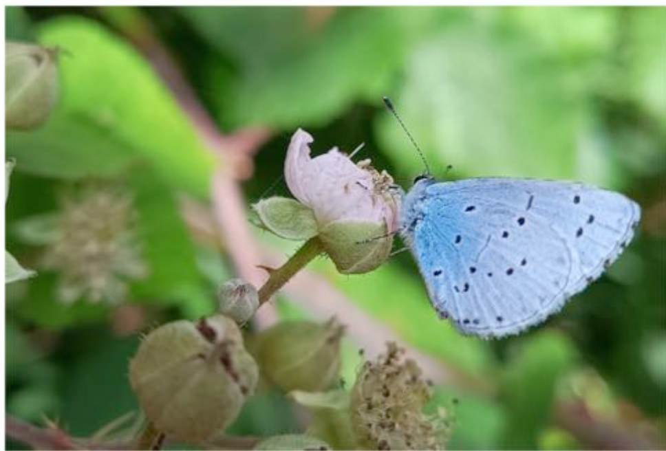
Holly Blue butterfly spotted during a u3a walk near Maisemore.

A photo relating to u3a taken by a member will be published each quarter.