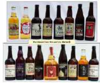
Howard Jenkins Cider