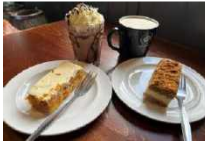
Dave Thomas Coffee and Cake