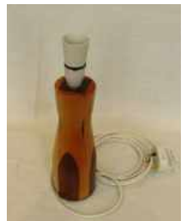
Alan Cooper Wood Turning