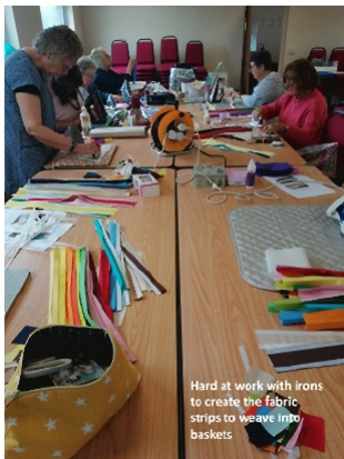
Hard at work with irons to create the fabric strips to weave into baskets