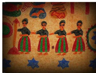
Examples from the Internet

The next Crafty Crafters meeting will be 8th March when we will continue with the kantha embroidery.