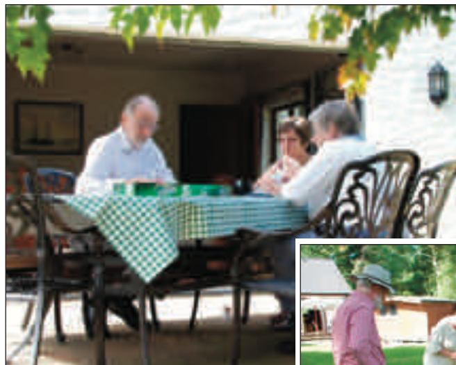
Games group enjoying the August sunshine. Last month (July) was too hot!

email: hyweldda.engagement@wales.nhs.uk or by telephone: 01554 899 056.