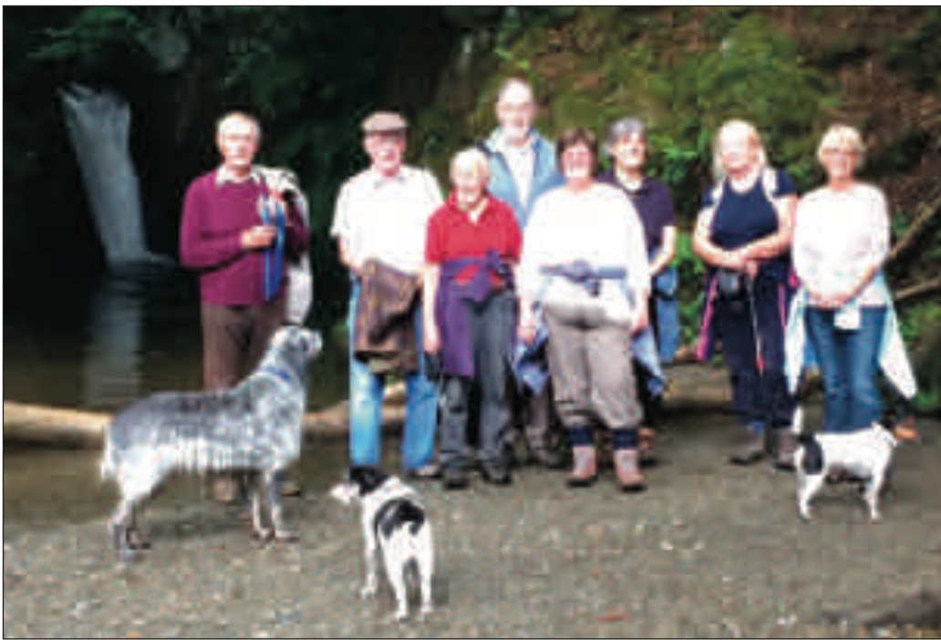
Strollers, August 2015 - Fond memories!

Teacher: Maria, go to the map and find North America. Maria: Here it is. Teacher: Correct. Now, class, who discovered America? Class: Maria. * * * * * Teacher: Glenn, how do you spell 'crocodile'? Glen: K-R-O-K-O-D-I-L Teacher: No, that's wrong. Glenn: Maybe it is wrong, but you asked me how I spell it. * * * * * Teacher: Clyde, your composition on 'My Dog' is exactly the same as your brother's. Did you copy his? Clyde: No, sir; It's the same dog.