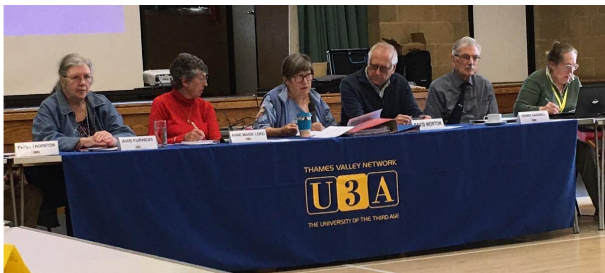
Current TVN Committee members

During the Covid pandemic there were more than 50 talks organised, and many Newbury members were able to take advantage of them. As we are now free to meet, the number of events has been reduced, but there are still some interesting topics coming up.