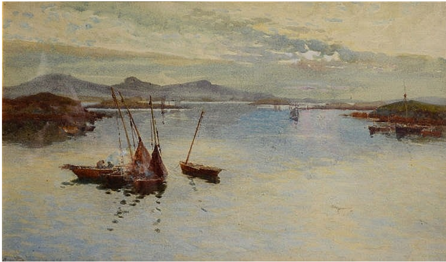
'Sailing vessels in Tranquil Waters' Hamilton MacCallum ( no date)