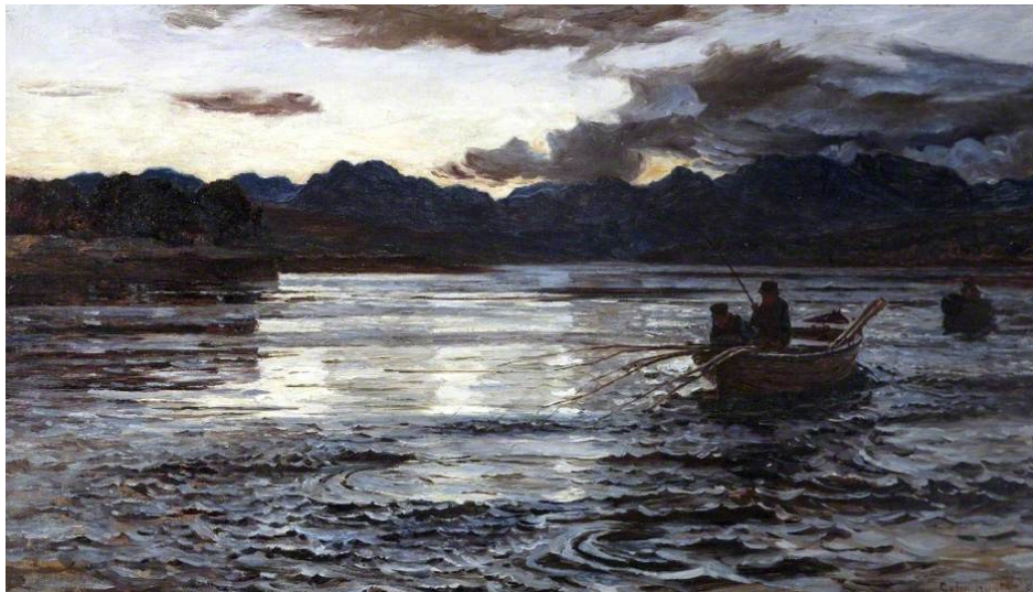
‘Summer Fishing’ Colin Hunter 1881

They all loved the West Coast and portrayed the realism of the everyday life of the local people and their relationship to their environment. While Hunter and McCallum made successful careers in London McTaggart stayed in Scotland but they met in Tarbet each summer .