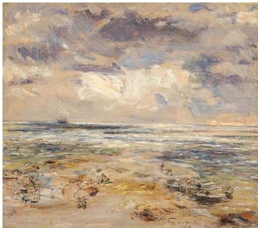
‘The Sailing of the Emigrant Ship’. 1895. William McTaggart

A selection of work can be found in the The National Galleries of Scotland , the Kirkcaldy Art Gallery and the The Tate.