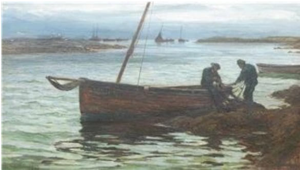
‘Fishing in the Harbour of Oban’ Colin Hunter 1892

Fishing boats, fishermen and their families were frequent subjects .