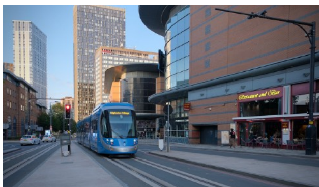
Broad Street tram - 'First September Evening'