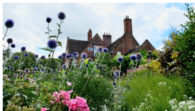
Bee friendly border, Winterbourne House & Garden, summer 2023