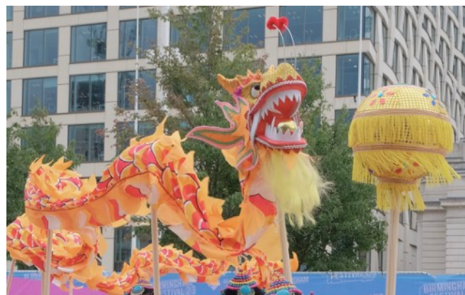
Dragon of the Wan Sheung Chinese Cultural Dance Group performance for the Birmingham Festival 2023 in Centenary Square, 3 August.