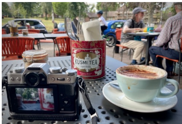
'Preparation' - for DPG location meet 'People in context'