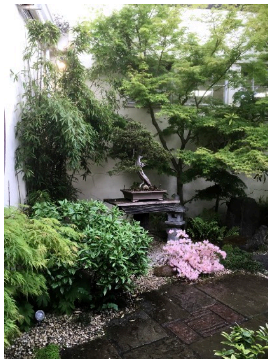
Quiet corner of Botanical Gardens by Ken Fisher