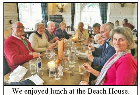
We enjoyed lunch at the Beach House.