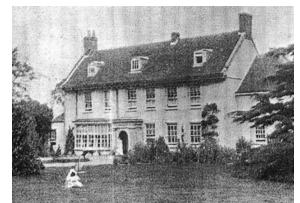
West Sussex Past Pictures

On a walk round Graylingwell Park in Chichester with the Short Walks group late last year I saw the shape of Graylingwell Farmhouse pictured here c1904 but now