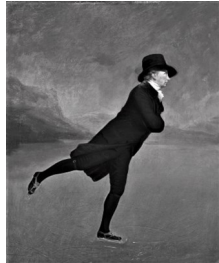
"The Skating Minister" Henry Raeburn National Gallery of Scotland

New course, starting in July: 'An Introduction to Scottish Art'. Many of Scotland's finest artists sought their fortunes south of the border and, as a result, they are simply perceived as "British" (for example David Wilkie). But Scotland enjoyed a vibrant art scene with its own art institutions and art schools. Henry Raeburn was the first significant artist to pursue his entire career in Scotland, while in the late 19th century the "Glasgow Boys" achieved renown, followed in the 20th century by the "Scottish Colourists" and some remarkable female artists.