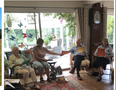
History 1 Group deep in discussion