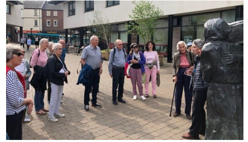
Rapt attention on a trip to Northumbria in June