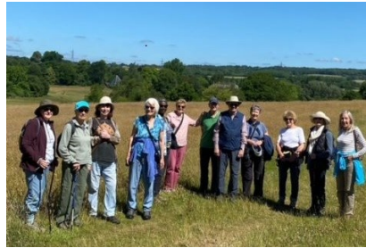
"Short Walkers" happy in the sunshine near Woolbeding