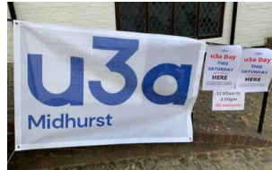
Our new banner outside the Old Library for u3a Day. It has also been at the Midhurst Farmers & Artisan Markets - see "Member get Member" on the front page

In July members had an interesting visit to Canine Partners at Heyshott and the summer lunch at Cowdray Golf Club was greatly enjoyed.