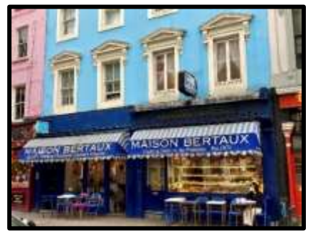
Maison Bertaux – London's oldest French patisserie