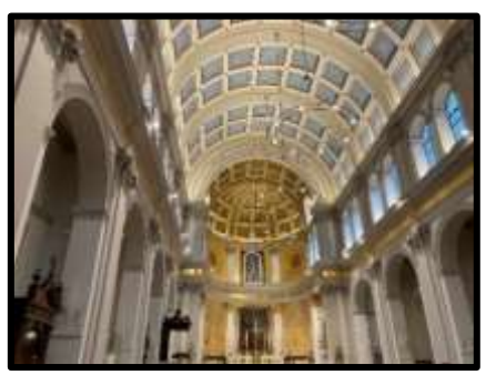
St Patrick's – the oldest church in London dedicated to the Irish patron saint.