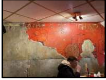
The 2i's coffee shop that was regarded as the birthplace of rock and roll in the UK (it is now a Fish and Chip shop).