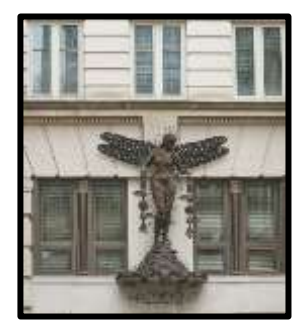
"Selene", a bronze figure, is named after the Greek goddess of the moon and of magic.