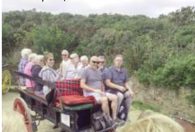
Guernsey Trip - Traffic Jam In Sark

There will be a minimum number required.