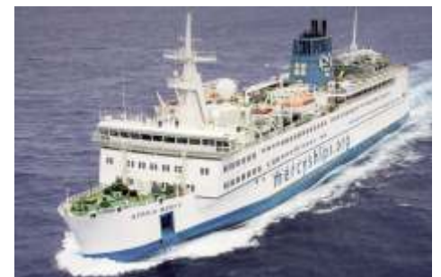
'The Surgery Ship'

Tuesday 15th August St Paul's Church Hall, Compstall 10am to 12 noon in aid of 'Mercy Ships'