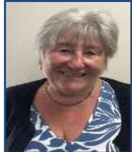
Lynne Paytee Committee