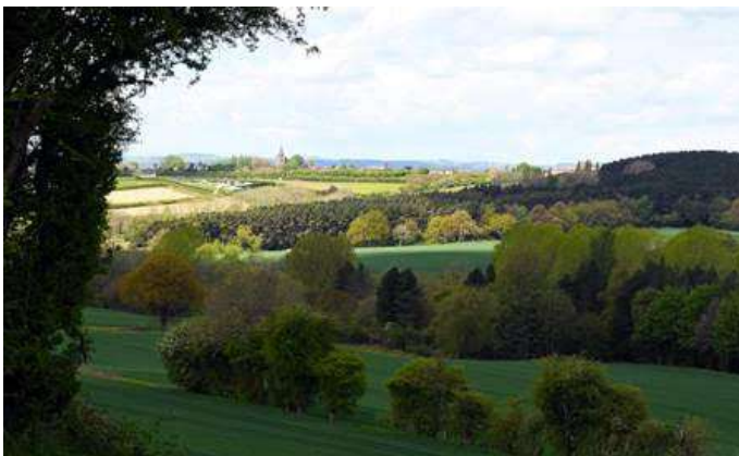
Underwood Church can be seen in the distance

The track leads onto a field edge path, with far reaching views across to Underwood and beyond to your right.