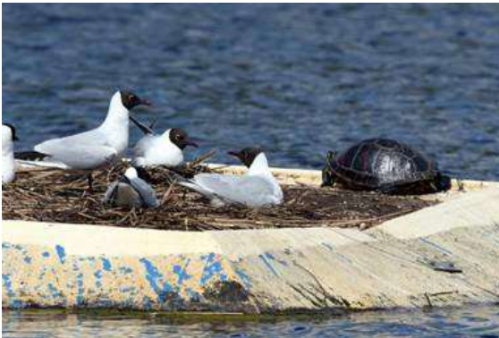
Red-Eared Slider Terrapin with nesting Black-headed Gulls

At the end of the day, we had seen/heard 39 different varieties of birds.