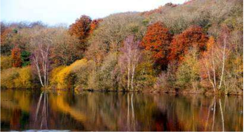
The Lower Reservoir