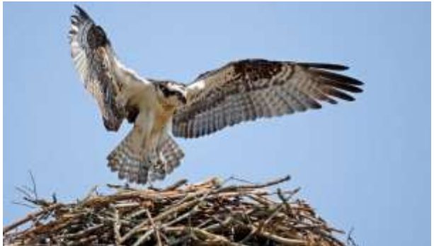
Osprey landing on its nest.

This internationally famous nature reserve is managed by the Leicestershire & Rutland Wildlife Trust in partnership with Anglian Water and provides one of the most important wildfowl sanctuaries in Great Britain, regularly holding in excess of 25,000 waterfowl, as well as many other birds, the most famous being the breeding Ospreys.