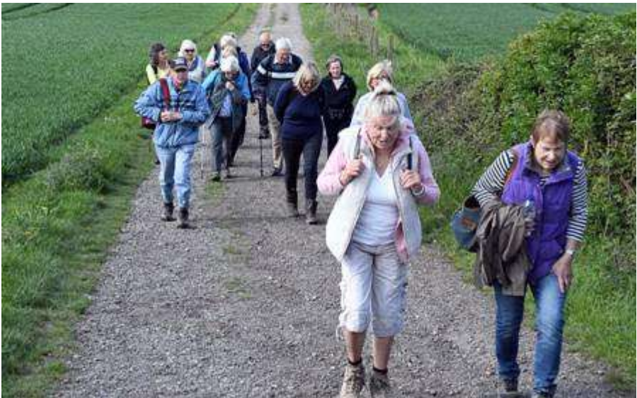
The initial long climb

We began our walk from Felley Mill Lane, adjacent Felley Priory and as we like to begin our walks, we had a gentle climb uphill taking in the super landscapes.