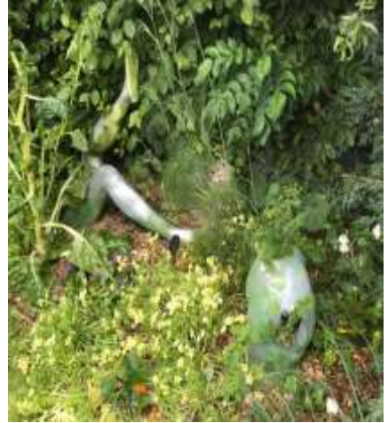
The Manikin Garden