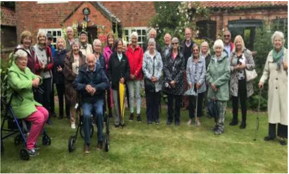
The smiles say it all