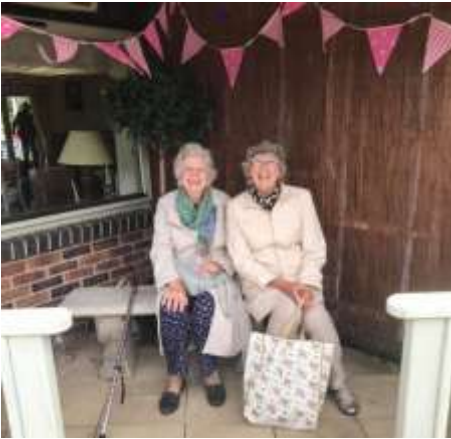
A well-earned rest