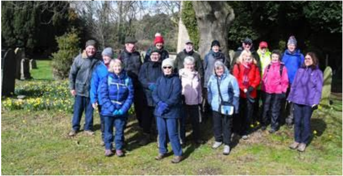
Some of the walking group in sunny weather