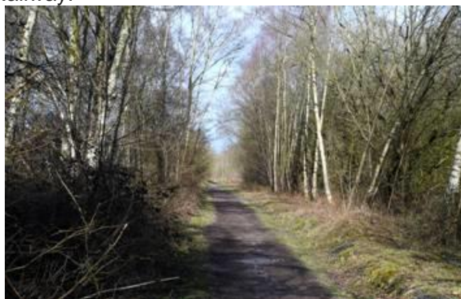
Footpath on the Old Great Central Railway Line

They were all built by different railway companies, the Midland Railway, the Great Central Railway and the Great Northern Railway.