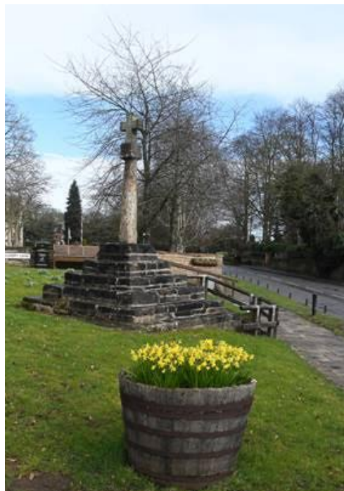
Linby Cross erected in 1660

From Papplewick we had a short stop at St. James' church, Papplewick to look at the daffodils in the church grounds. A church in these grounds was first recorded in 1170. Our walk then took us back into Linby.