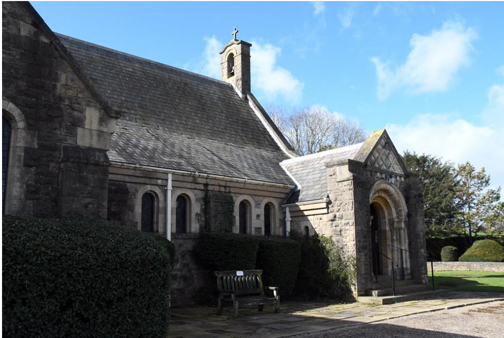
St Winifred's Church

St Winifred's Church was the traditional burial place of the Dukes of Portland and their families, most of whom are interred in the small churchyard. Note the names of those buried there... Dukes & Duchesses of Portland, Cavendish & Bentinck.