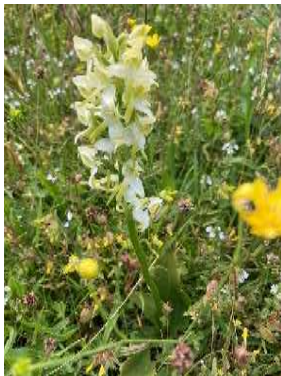
Great Butterfly Orchid – Hartington

Solomon's Temple, Hartington Station, Miller's Dale Station and quarry and Wharton Cragg were visited and it is planned to go to some of them together with Lathkill Dale, Dane in Shaw meadows and Jackson's Brickworks again.