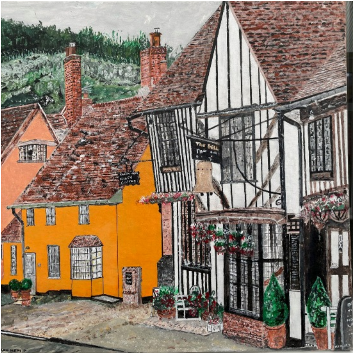
← Kersey nr. Ipswich