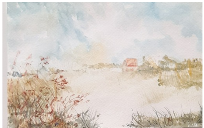
View from a window By Anne Edwards