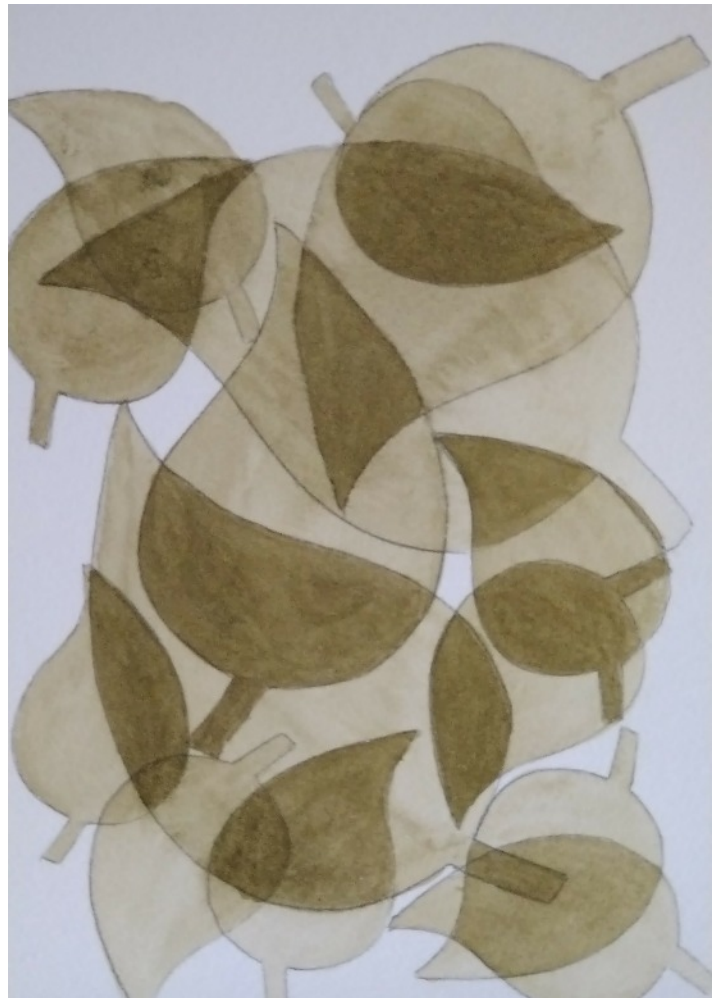
3 beautiful miniatures in coloured pencils & a monochrome Abstract in watercolours. All by Irene Creevey