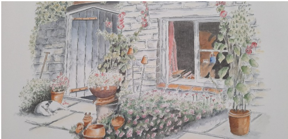
View from a window By Kevin Real