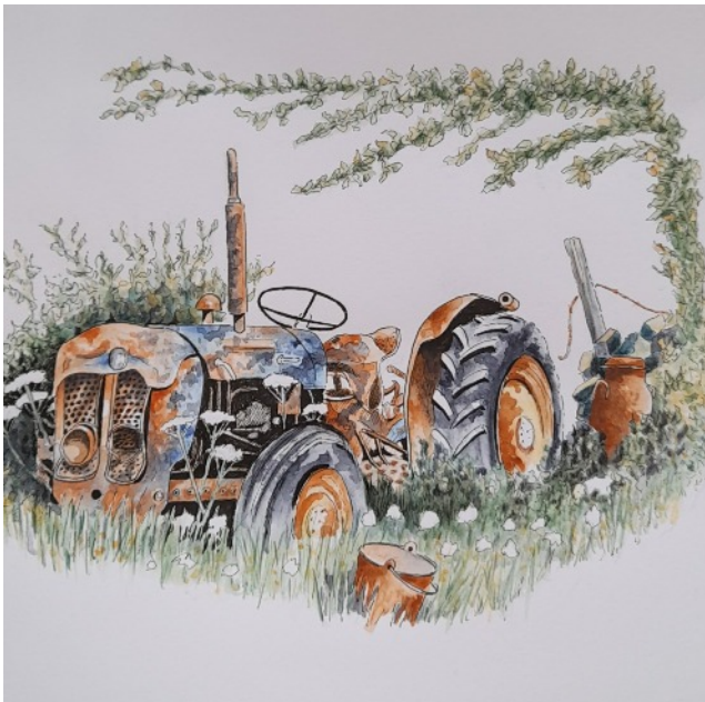
Tractor