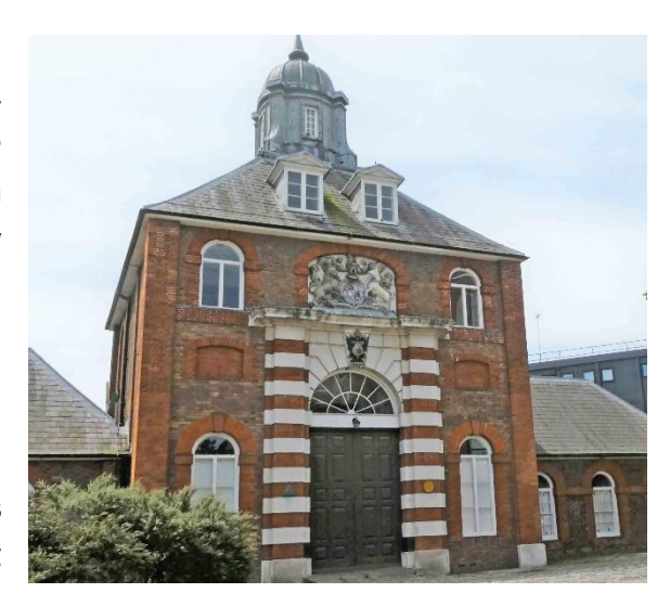
The grade 1 listed Brass Foundry

Our walk of two miles will take about 2.5 hours and is accessible being on paved surfaces with no steps and just a few cobbled areas. There will be a short refreshment stop on the way. Our meeting point will be near outside the Woolwich Elizabeth Line Station