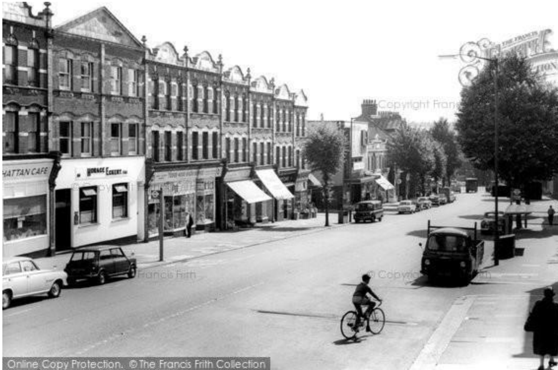
East Finchley High Rd E side, North of the cinema, 1968