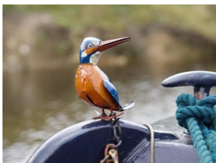
Picture Number 2: I want one of these for my garden! The birdwatchers sometimes see one from the hide on Hollingworth Lake. Where do you think the photographers spotted this one?